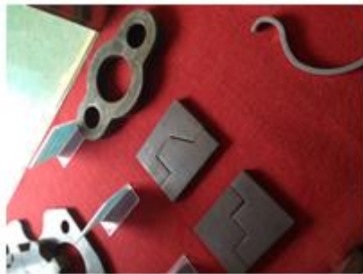
Fig. 2 Physical graphics