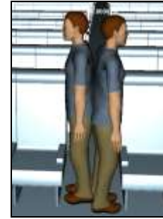
Fig. 4 The energy rate when passengers lift luggages