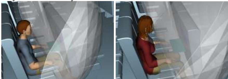
Fig. 3 Simulation results of vision fields for male and female passengers

For the sitting postures, taking the scene of ‘watching the entertainment system’ as example, the 50th percentile male and females passengers are chosen as the evaluation objects, and the occupant models are adjusted to the corresponding sitting postures in the tourist class. Fig. 3 shows the binocular visions of man and female passengers, respectively. The results indicate that the entertainment systems are in the range of passengers’ great visions, and thus the passengers can use the entertainment system comfortably.