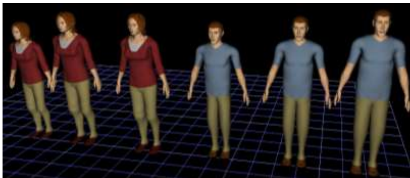
Fig. 2 Occupant model with different percentiles

Based on the GB/T10000-88 Chinese Adult Body Size data[8], the 5th, 50th and 95th percentile human models of male and female are built, respectively (see Fig. 2), and the following simulation analysis is carried out on the basis of the built human models.