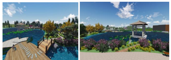
Fig. 5. Landscape road pavement figure

Rich techniques can be used in ground pavement because of the diversified road forms. For example, the wide roads in the center of the landscape use traditional simple pavement, while the landscape footpaths use wood and pebbles. The waterborne platforms use marble pavement to create a simple and natural atmosphere “Fig. 5”.