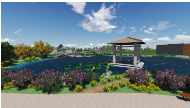
Fig. 7. Featured landscape design

The featured landscapes have various kinds. Waterborne platform and stepping stone on water surface are designed beside water system; tables and benches are set among lush trees, in order to make the landscape peculiar with strong ornamental value and practicality. As shown in "Fig. 7".