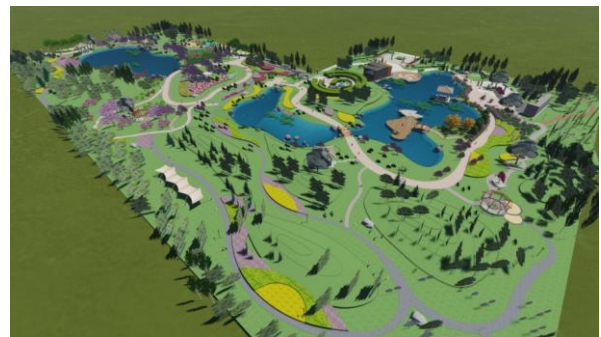
Fig. 1. Comprehensive landscape map.

In this design, the project depends on Big Nanshan in the west, overlooks Shenzhen Bay in the east and is next to the developing Sea World financial district with superior geographical environment but the traffic is inconvenient "Fig. 1".