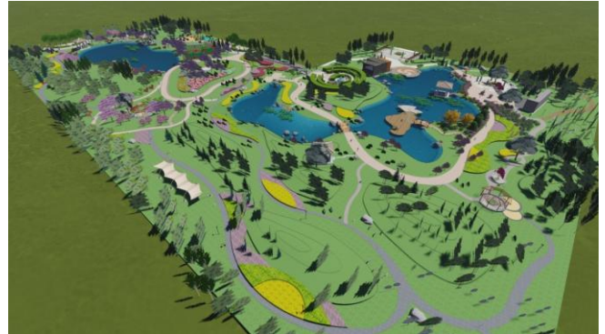
Fig. 4. Road design in landscape area

Road landscape design integrates contact space with living space. The dendritic or cyclic end break roads extend to the interior of landscape in order to make the road can reach each scenic spot. The layout of road should be vivid and flexible. In this project, the landscape layout and road planning carry out according to characteristics of project. The roads make a distinction between the important and the lesser one and have diversified forms according to lakes to make the roads in the landscape flexible and winding but have good accessibility. The landscape layout and road extension coordinate mutually and integrate closely. Like the framework of landscape, roads organically connect buildings with scenic spots to embody integrity “Fig. 4”.