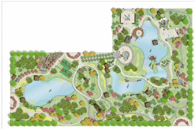
Fig. 2. Project planning map.

Established in the center of landscape, the fountain is surrounded by green trees to increase the safety of landscape. The sense of depth is ensured in design. After the fountain opens, it forms contrast of height with dwarf trees around and the lakes in the distance “Fig. 3”.