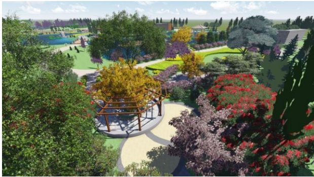
Fig. 6. Landscape

The landscape design in this project makes the best of the original natural landscape, analyzes the style of buildings and adopts various kinds of plants "Fig. 6".