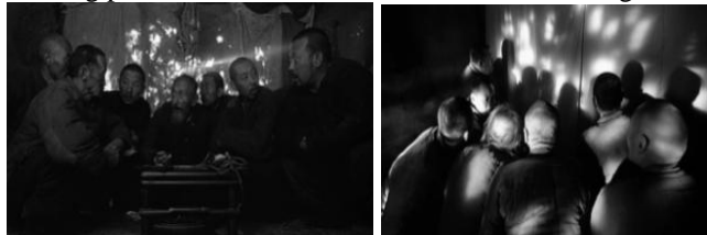
Fig. 2. The farmers' space.

1) Ma Dasan and The Farmers' Space : Seven actors, aswarm; bright background with shabby curtain and thick rope; farmers stay in high position, playing as inquisitionists. We can see the complex moods reflecting by the space. Bighrness implies justice, while the huddle implies farmers' nervousness and fear, especially the light passing through the holes in the curtain beacons the rocking rope, just like their gallows. On the other hand, they become huge shadows on the cloth, implying invisible and powerfull, showing panic and unknown from the other side. "Fig. 2"