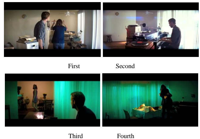
Fig. 4. The different changes in different times.

In the first time, the whole space is in a muddle, implying Sebastian's situation, holding unrealistic dream and having nothing to do. In the second time, after his sister's taunt, the wooden chair as the metaphor of the jazzy dream stays in the corner of the wall on the floor. All the changes implies the changes in his mind, still holding the dream but falling into inner contradiction.