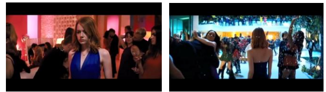
Fig. 6. LALA LAND Mia gets out of washing room.

2) Dissimilar : There are distinctions between space and theme, they are keeping in inverse ratio, which space amplifying the theme in the contrary way. "Fig. 6"