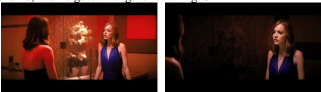
Fig. 5. LALA LAND Mia in mirror.

1) Similar : The design of space must be on purpose, except for the physical function, the selected elements are sign of some tones that can show narrative theme. In this condition, there is a positive correlation between space and theme, theme gets strengthened. "Fig. 5"