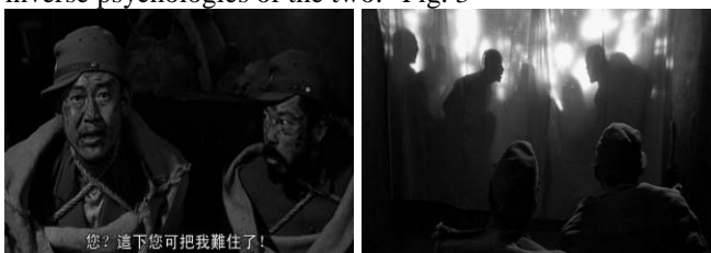
Fig. 3. Japanese soldier and chinese translator's space.

2) Japanese Soldier and Chinese Translator's Space : Two actors with mussy farm tools, implying the manipulated fate ; Lower position and darkness, implying they are being interrogated and filled with fear. So they can see huge black cucoloris in their eyes. But the space is a little wilder than the farmers', implying the parochial militarism with death. Jiangwen narrows the shot and scene, shrinking the space. Then the space means the stubborn will and awkward condition of the Chinese translator. The compare shows the inverse psychologies of the two. "Fig. 3"