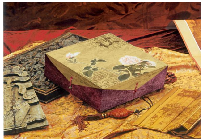
Fig. 1. Visual design scheme of mooncake packaging.