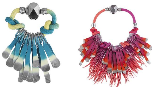
Fig. 4. Dior jewelry made of comprehensive materials