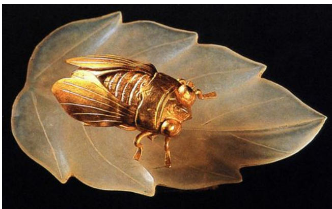
Fig. 6. "Golden Cicada jade leaf" of Ming Dynasty