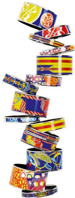
Fig. 3. Enamel ring

Diancui means using the kingfisher feathers to decorate in the surface of metal jewelry; due to colorful Kingfisher feather and uneasily faded, the headwear produced by the use of Diancui techniques is welcomed by the ancient elite class. Using traditional Diancui techniques in contemporary jewelry design requires designers to adopt alternative processes because Kingfisher has become a national protected animal, and it is no longer possible to reproduce the traditional process. However, innovative applications can achieve unexpected results. "Fig. 3" shows some jewelry produced by using enamel crafts, and colorful enamel glaze can enhance the color tension of jewelries. At the same time the use of animal feathers in Diancui process also reminds us, all kinds of feathers and other soft materials can extend the material range of jewelry. As shown in "Fig. 4", they are some feathers of Dior jewelry combined fiber and metal, with strong color and pure luster.