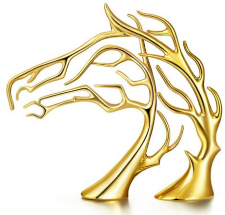
Fig. 7. Tree and Horse