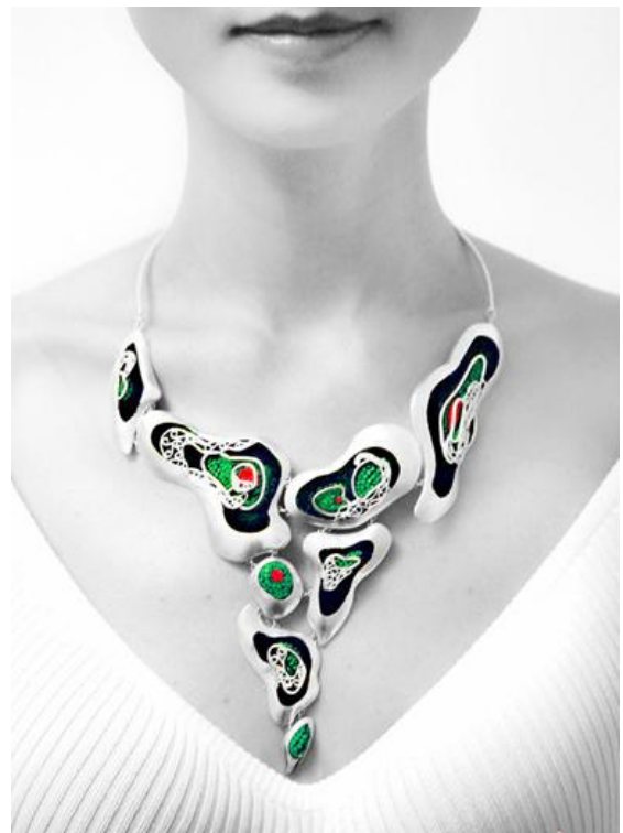
Fig. 2. Landscape Guizhou - Concept Silverware

Filament mosaic is divided into "filament" and "mosaic" two parts. Filaments adopt gold, silver and copper as raw materials and use pinching, filling, assembling, welding, weaving, heaping and other traditional techniques for bending molding; mosaic means using sheet metals to make brackets embedded with pearls, precious stones and so on. Filament mosaic techniques are still in use in today's jewelry design and production, and the jewelries produced with this technique basically are relatively traditional due to following the ancient jewelry styles. By applying filament mosaic in the jewelry design or innovating of the traditional skills, it can maintain the forms of ancient skills and combine with the contemporary jewelry design styles and types to design contemporary art jewelries with a strong sense of the times. As shown in "Fig. 2", Guizhou Normal University Zhang Yuewei's work - Landscape Guizhou - Concept Silverware adopts Guizhou's intangible cultural heritage - Miao embroidery and combines with modern filament craft and handmade silver forging process. The work not only contains the strong feelings of old artists to traditional culture, but represents new prominent designers to show respects for more ancient art craft.