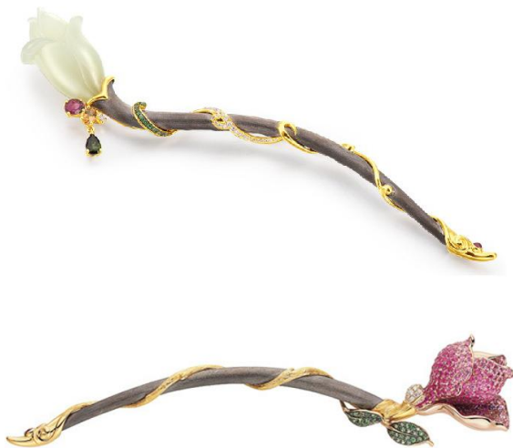
Fig. 1. Yulan hairpin