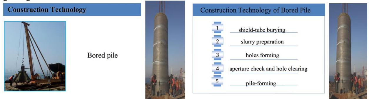
Figure 1. Construction Technology.

First of all, it will introduce the relevant knowledge points combined with the content of teaching materials in the micro-lecture video of construction technology of bored pile. The knowledge points contain shield-tube burying, slurry preparation, holes forming, aperture check and hole clearing, pile-forming, and so on. Each construction segment will be introduced in the process. With the short character of micro-lecture, only the essence part will be explained concisely. It helps learners to learn the essence of the content and remember easily. Construction site pictures are added for the learners to understand and master easily, and PPT with concise master and text is obvious for the learners. Fig.1-Fig.4