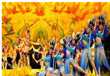
Fig. 5 " dream of Dunhuang ".