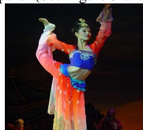
Fig. 4 " the Silk Road Flower Rain ".