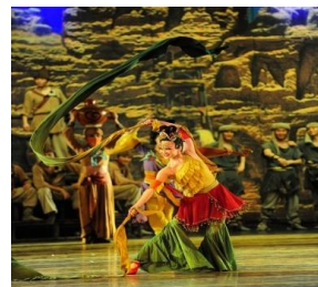
Fig. 6 "Dunhuang dream".