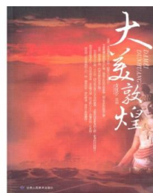
Fig. 2 beauty of Dunhuang