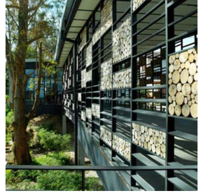
Fig.7 The BOH Visitor Center Fig.8 Elevation Materials of