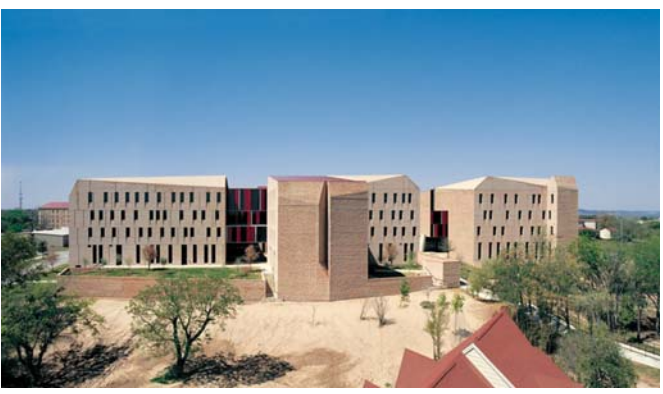
Fig.3 Barberí Laboratory