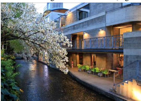
Fig.1 Kagawa Prefecture Hall.