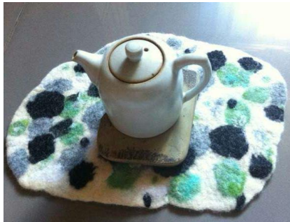
Fig. 7. Yi elements applied to the design of tea set.

In the tea cultural articles, the special rolling felt process and the needle embroidery of the Yi nationality are used to make the materials of ordinary style into the tea table articles with unique style of the Yi people, which achieves the perfect integration of beauty and utility.