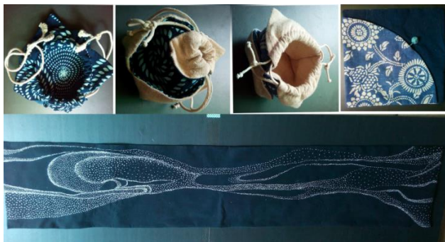
Fig. 8. Yi elements applied to the design of tea set.