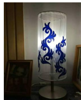
Fig. 5. One of the Yi patterns applied to Home Furnishing.