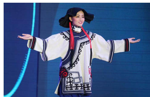
Fig. 1. The direct use of Yi costume' elements.

The direct use of national patterns and colors is divided into two kinds: one is to use the whole form of national costume design directly in modern design. The traditional totems of Yi nationality have many patterns. They can change their traditional patterns and apply them to costume design to the original charm of dress. The other is that the partial form of national costume is directly used in the design.