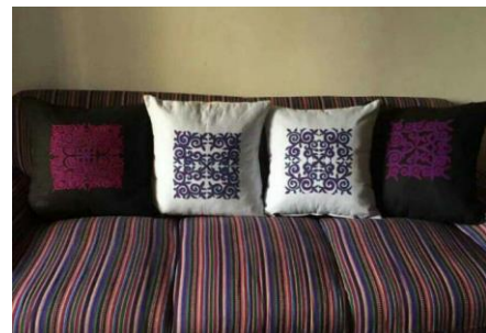
Fig. 4. One of the Yi patterns applied to Home Furnishing.

The patterns of the Yi people have unique beauty. We can not only use it in the clothing, but also apply it to the household decorations. For example, the curly grass pattern and disc embroidery technique on the pillow and lampshade in the left fig. has made the modern pillow and the unique national charm. It is not only the simple patterns for decoration, but also is the carrier of national culture.