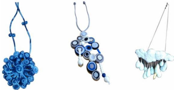
Fig. 6. The design of Yi accessories.

These accessories below are clothing works from the teachers and students of Panzhihua University; it combines the inclined disc embroidery and grape button knot combination process of Yuexi, and in the middle ring made by an inclined disc embroidery put the agate, crystal, beads made of obsidian, which create the ethnic style jewelry fully combining the tradition and fashion, and it reflect the aesthetic needs of people to return to the traditional generation.