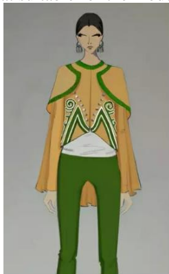
Fig. 3. The second sample of applications to refactoring Yi's elements.

2) The association between shape and shape: Two or more than two things in the shape or structure have similar morphology, which helps to cause the thought between the shape and things, and is good for creating a new form or structure and give it new meaning. It is possible that to adopt the style and structure of the traditional costume of Yi nationality, absorb the special patterns of it, simply the complex clothing style and then change them into the simple style for clothes that suitable for the modern people.