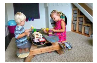
Fig. 8. Old skateboard tables and chairs.

"Old skateboard tables and chairs", Skateboard play can be converted into tables and chairs, remove the wheels of the skateboard as solid and durable, and graffiti shape also makes tables and chairs more unique. "Fig. 8"