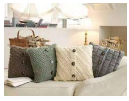
Fig. 9. Old sweater pillow.

There will always be some old sweater inside the home, throw away the pity, we can cut the old sweater, plus buttons, play creative, made their own style. Such as can be made into an interesting size backpack,comfortable pillow "Fig. 9", both stylish and exclusive feeling. Can also be made into red wine packaging "Fig. 10", to reduce the chance of being broken.