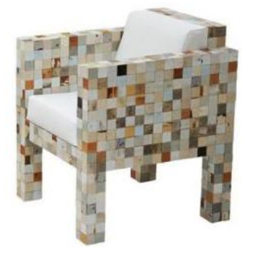
Fig. 2. King Of Upcycling series wood furniture.

And his other series KING OF UPCYCLING "Fig. 2"–Piet Hein Eek. Giving the impression that it is eclectic, cool and difficult to resist the idea, from the hut–style home office, Door