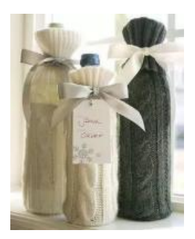
Fig. 10. Old sweater red wine packaging.

In the interior design, some old clothes can be used as pillow, gloves "Fig. 11" to design, so that their own furniture has a mysterious retro feelings. Truly split the reorganization, so that every piece of waste can be used as a reusable material.