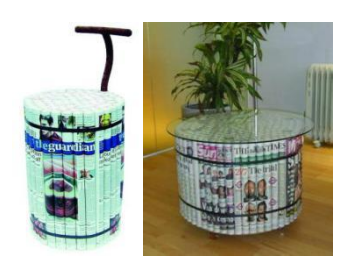
Fig. 4. Sunday newspaper table and chair.

This Sunday newspaper (chair / stool "Fig. 4"), which was designed by designer David Stowell using a tight-knit Sunday newspaper. By connecting the hand-rolled newspaper and the polypropylene belt material together. The product encourages people to turn their attention to materials, especially those in the eyes of the waste, and re-valuation of these waste, looking for new ways to use them, rather than discard them. Of course, we still have a lot of ways to make an artistic transformation of the old book.