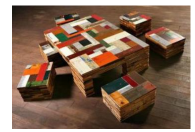
Fig. 1. Waste Waste 40 \times 40 series wood furniture.

Belt Furniture–Dutch designer Piet Hein Eek created a collection of small wooden mosaic furniture, world-renowned Waste Waste 40 \times 40 series "Fig. 1", the entire series are 40 \times 40mm waste Wood cutting cube–are scraped from the waste wood furniture waste, and then cut together carefully made together to create a new work.