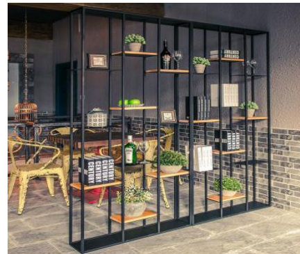
Fig. 11. The screen in the office space.

In the office space, creative separation is used to separate from space. The iron stand in industrial style is matched with potted plants in different modeling to refresh and regulate work atmosphere, so that human mood can be relaxed and relieve working pressure, his kind of screen as shown in “Fig. 11”.