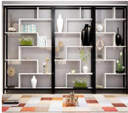
Fig. 13. The application of antique-and-curio shelves.

In the past, antique-and-curio shelves were often applied in Chinese-style interior design, with wood texture and single brown colors. With the constant development of interior design, the style of antique-and-curio shelves also becomes increasingly diversified, as shown in the “Fig. 13”. Based on the antique-and-curio shelves with sufficient sense of design, black is interspersed in the white. It can be placed in the living space or office space to separate space, showing the integration of elegance and calm in modern fashion. In the selection of service space, the design can be applied flexibly to meet sensing demands and mental demands, no matter for high-end and decent minimalism or countryside child-free style favored by women [9].