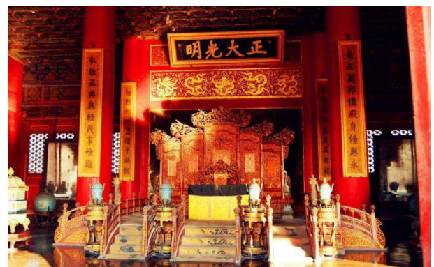
Fig. 6. Typical screen style in the Ming Dynasty.

In the Ming Dynasty, screen was developed into the stable and mature period. The screen could be divided into unfolded screen with pedestal, table screen and curved screen. There was mainly the unfolded screen with pedestal, showing the exquisite and meticulous figures. Screen fabrication was equipped with advanced hardwood, especially for dalbergia odorifera and padauk. The wood grain was natural and fresh. By comparing with the previous dynasty, screen technology in Qing Dynasty was tedious. It probably could be divided into unfolded screen with pedestal, hanging screen, folding screen and table screen. Yongzheng and Qianlong periods were of great prosperity, which could be shown in numerous examples. The sumptuous degree was even superior to the previous dynasty. The most representative one was the screen behind the emperor’s throne in the imperial palace, as shown in “Fig. 6”.