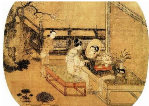
Fig. 5. Typical screen style in the Song Dynasty.

Song Dynasty, screen was increased with the height of seat, thus the pedestal of screen was developed into bridge-type pedestal with strip ledger. At the moment, screen had the simple and plain modeling structure and there were few tedious decorations, as shown in “Fig. 5”. With the elegant style, it made people feel the beauty of freshness and nature [5].