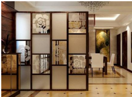
Fig. 17. The glass screen.

The glass screen separation as shown in "Fig. 17", not only has the good visual effects, but also can increase interior brightness in all directions, thus it seems that small environment isn't separated or divided to some extent, destroying the rigid and occlusive space. The entire space can be vivid and energetic. The good sound insulation effects can ensure that everyone get away from the noisy disturbance and work in the quiet environment. Furthermore, glass also can be combined with other elements to present more design choices.