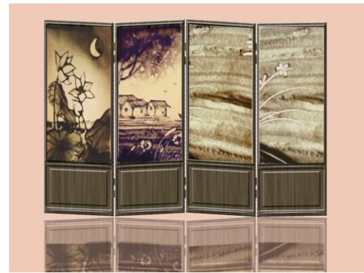
Fig. 18. Sand elements are applied in Chinese-style screen.

As a unique artistic form in modern society, common sands can be used to create the beautiful artwork by hands. It conforms to aesthetic appreciation of modern people and has the higher aesthetic value.