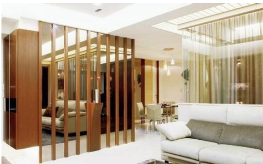
Fig. 9. The screen in the living space.

To place the screen in a large bedroom is also a good choice. According to Fengshui Theory, “master bedroom shouldn’t be too large, because geomancy is easy to weakened and scattered.” The rest space in the master bedroom is separated from make-up and office space, as shown in “Fig. 10”. This not only can ensure privacy of rest space, but also will be good for sleep and health.