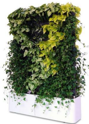
Fig. 14. Application of decorative screen in plants.

Breaking through the constraint of traditional screen design for many years, furniture companies in Northern Europe utilize various green plants to separate the interior space, as shown in “Fig. 14”. These green plants can be placed in family space or office space, so as to build the relaxed, pleasant and beautiful environment for their daily life and cultivate their taste. In addition, natural plants in a large area are good for purifying interior air, so that people can breathe the fresh air and it is good for human health [10-11].