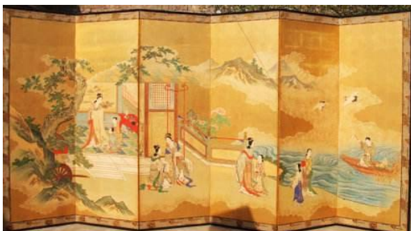
Fig. 4. Typical screen style in the Tang Dynasty.

Song Dynasty paid attention to rational thinking, advocated to worship the nature in the process of creation and pursued for order and law. With the lifestyle change in