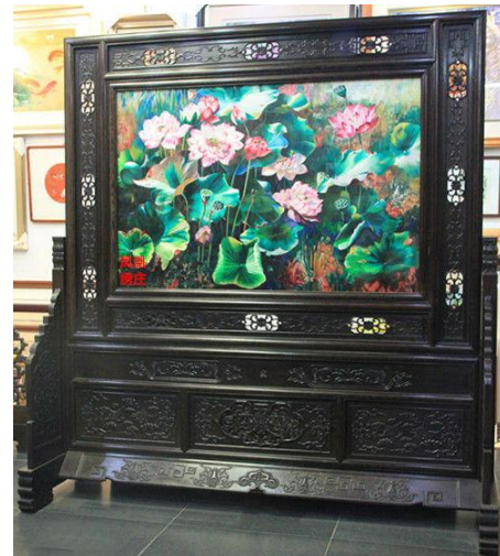
Fig. 1. Screen style in the Warring States Time.

[3]. Painted screen earthed from the Chu Grave in Xinyang (a city in Henan) had several snack-like dragons (Panli) twining on the seat. With smooth and natural workmanship, these snack-like dragons were lifelike, as shown in “Fig. 1”.