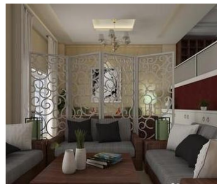
Fig. 16. Hallow carved screen.

Hallow carved screen is placed in the small-scale room, as shown in “Fig. 16”. The screen separates the bedroom from the living room. It is beautiful and magnificent, also plays a decorative role and increase sense of design in the interior space. This not only can ensure privacy of the bedroom, but also can accept coats and hats, providing convenience for human life.