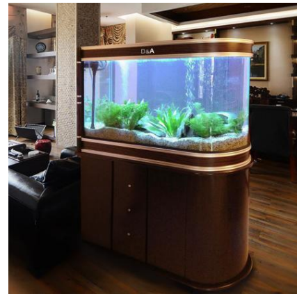
Fig. 15. Application of fish tank.

Application of fish tank is a kind of fashion in modern home decoration, as shown in “Fig. 15”. The space between the living room and the restaurant is separated by the fish tank. Visually, water is used as the separation to increase the house area, decorate the space and make residents pleasant. In addition, moisture evaporated from the fish tank can increase moisture in the living room to relieve the drying environment. It is good for fitness of residents.