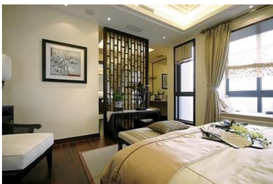
Fig. 10. The screen in the bed room.

3) Application in Office Space: An office is a primary area for daily work and study. Office design affects human mood directly. It is directly connected with work efficiency,