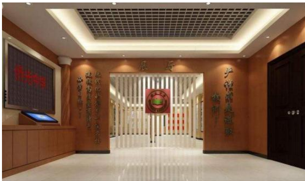
Fig. 7. The interior screen at the entrance.

In addition to keep out the wind, screen also could shield the sight. In ancient times, people placed the screen in the axis of buildings to compensate for leakage in the open space. Afterwards, people often placed the screen in the entrance of interior space with the constant development of economic society, especially for the large space, such as banquets and exhibition rooms, etc., to keep out the wind and shield the sight, as shown in “Fig. 7”.