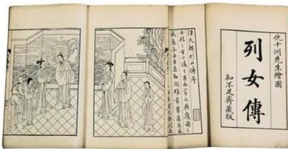
Fig. 3. Typical screen style in the Wei and Jin Dynasties.

During the period from Wei and Jin Dynasties to Sui Tang and the Five Dynasties, multi-fan screen describing landscapes started to be popularized and it had no need to install pedestal, but just needed to open a fan to stand upright. In addition to display, the screen could keep out the wind, as shown in “Fig. 3”. During the period of Sui Tang and the Five Dynasties, screen had various categories. Refined scholars wrote articles and painted on the screen and such a style was prevailing. Screen not only could be used as the decorative element in the interior, but also could separate from the space. During the period, there were different types of screen, which were main force for furnishings, as shown in “Fig. 4”. The role of separating from the space for the screen was also stood out during the period of Han and Tang Dynasties [4].