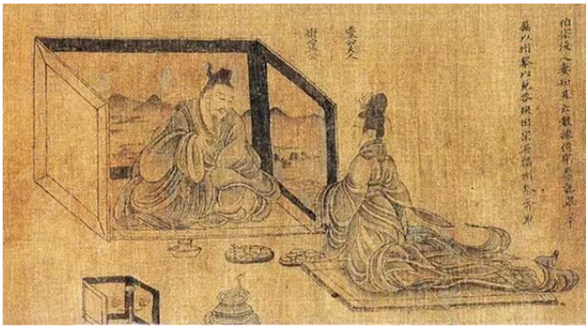
Fig. 2. Screen in the Han Dynasty.

During the period from Wei and Jin Dynasties to Sui Tang and the Five Dynasties, multi-fan screen describing landscapes started to be popularized and it had no need to install pedestal, but just needed to open a fan to stand upright. In addition to display, the screen could keep out the wind, as shown in “Fig. 3”. During the period of Sui Tang and the Five Dynasties, screen had various categories. Refined scholars wrote articles and painted on the screen and such a style was prevailing. Screen not only could be used as the decorative element in the interior, but also could separate from the space. During the period, there were different types of screen, which were main force for furnishings, as shown in “Fig. 4”. The role of separating from the space for the screen was also stood out during the period of Han and Tang Dynasties [4].