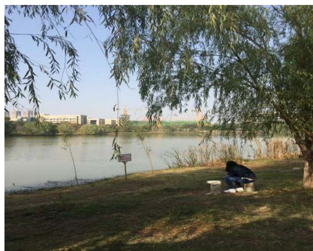
Fig.3. The lack of sanitation in the park