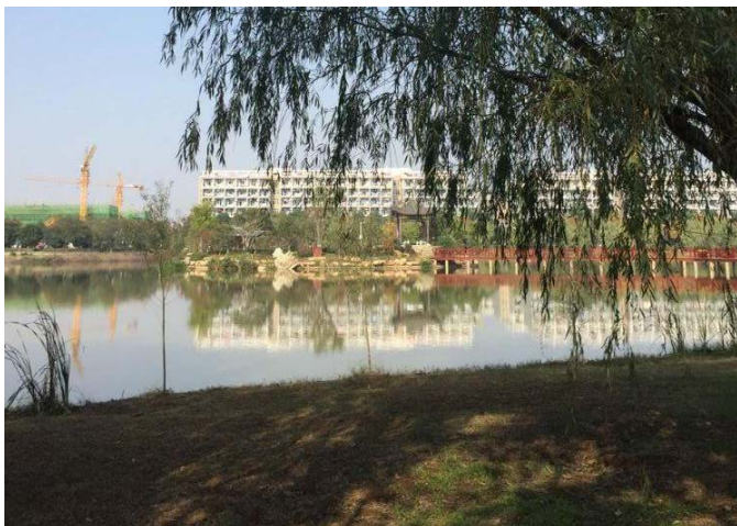
Fig.4. Sakura forest

2) Sakura forest only has seasonal ornamental value, and the ornamental value declines a lot after the sakura season. The surrounding slopes have not been fully utilized, and the trees are not tall enough with poor shelter, so the people do not want to stay for too long. (Fig.4)