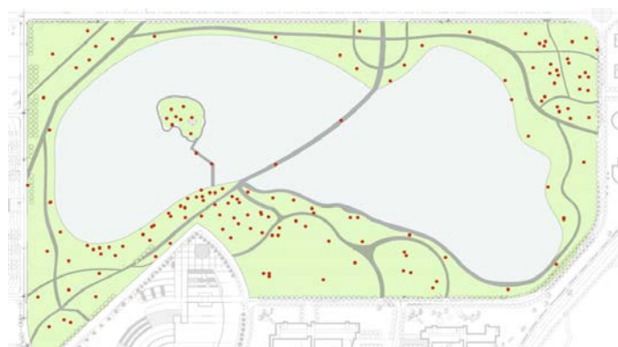
Fig.2. Crowd Distribution of the Main Space

According to the survey results, the flow of people is concentrated in the study & exchange area at the entrance of the lake island, the lake island and the fitness area close to the teachers' apartment, and the space type is mainly open space.(Fig.2)