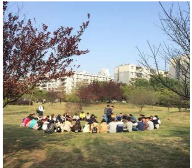
Fig.5. The behavior of the crowd in sunny day

4) Increase the lights within the park and enrich the night view. Increase the corridors or other landscape sketches to shelter wind and rains and facilitate students' activities on the rainy days. (Fig.5)