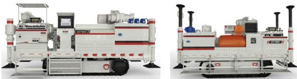
Figure 2 The moulding of directional drilling rigs

After years of research and application the drilling rig of Xi'an research institute of CCTEG has already formed a certain traditional features and product types, different kinds of drilling rig has external different structure. According to the structural type and product positioning, different original products has different color style and basically has the features of product image series, such as split drilling rig with red as the main color, some black with red, grand engineering drilling rig with yellow as the main color and crawler drilling rig with white as the main color.