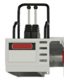
Figure 7 The moulding of walking console

Fringe oblique holes have the effect of cooling and decoration, and horizontal stripes appear stable and maintain the unity style of the whole machine. Otherwise, the model arranged like that would make the cooling air generated by the electrical machinery cool the pump in the passage of the sheet metal and hydraulic conduit at the bottom of the console, and the air would not blow to the drilling personnel, which could improve the comfort of operation. The overall decoration effect of the electrical machinery guard plate is shown in Figure 6.