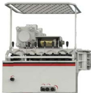
Figure 3 The moulding of master console

Master operational console for the directional drilling rig is the key part in human-computer interaction links, design of this part need to be fully combined with human-computer interaction principle. Designed master operational console modelling appearance is shown in figure 3.