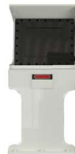
Figure 4 The moulding of computer

Black and red decorative stripe on the front panel enhanced the visual effect, operational instruction of round handwheel use the way that text with pictures, through changing the thickness of the arrow to reflect the change of parameters can echoes with text. Curved armrest and handles on the top of console facilitate the rotation of the console and can prevent the lateral accidentally touch to handle, improve the safety and convenience. The fence at the top of the master operational console use polyline elements and hollow out pattern to match the neat style of whole machine and the hollow in the both ends make the overall style feel more beautiful, lightness and unified, also the grid model of the fence can not only protect console but also does not affect the upward gaze. To avoid the tubing below console looks messy we designed a plate with horizontal decoration stripe below the console, the stripe can make the plate feel more marrow in visually.