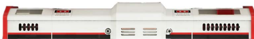
Figure 5 The moulding of auxiliary operating floor and cooling apparatus

Auxiliary operating platforms and cooler are arranged between the rig body and the vehicle platform so that these could be operated and maintained easily; two manual multi-valve cylinder is mainly used to operate the rig to stably lifting up and down the hydro-cylinder and adjusting the pitch angle of the feeding device. The operating platforms must be easy to identify during operation and also to prevent accidents such as accidental collision and unexpected drop. The design of this part wrap and decorate both the auxiliary operating platforms and cooler with the design program of the whole rig. The design uses three-fold style model to enhance the third dimension and sense of hierarchic of the box structure by changing the physical dimensions. In order to improve the degree of recognition of the vice operating handle, the designed indicating text of nameplate in this position should be corresponded with the joystick, so that it could avoid malfunctions effectively. The outlet hole in the position of the cooler can improve the ease of the cooling water pipe installation and disassembly, and the under stenciled design would facilitate the heat dissipation and enhance practical function. The overall modeling is shown in Figure 5.