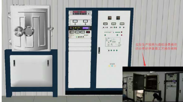
Fig.7. Selective focus experimental case: virtual experiment of vacuum coating

As shown in Figure 7, the project presentation introduces a method of combining actual production videos, which, on the one hand, is convenient for the learners to understand the concrete process of the actual production workshop and the processing of the instrument and equipment, on the other hand, is more convenient for learners to learn skills or pre job training with the hierarchical design of virtual and reality.