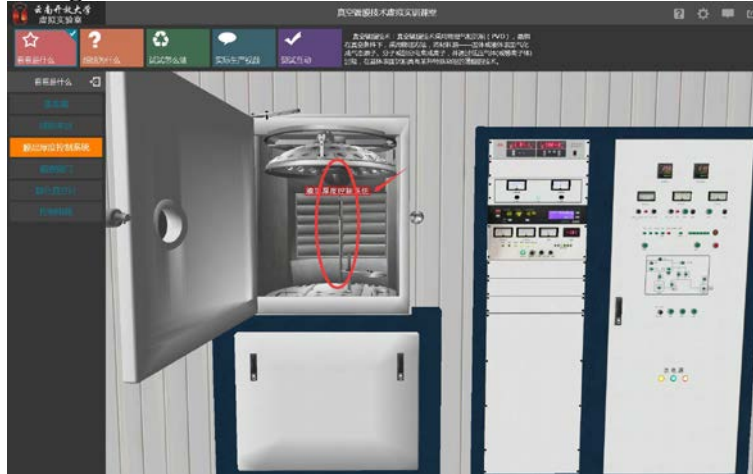
Fig.4. Experimental case of cognitive level: virtual experiment of vacuum coating

As shown in Figure 4, learners can independently explore the role and use of components, and when the operation goes wrong, the experiment will have an error message informing the experimenter of the error. At the same time, the system will pop up the undo, return, and re-execution buttons, meeting the needs of learners who wish to undo, return, and re execute. And it realizes the reversibility, fault tolerance and other functions of the cognitive level interaction design.