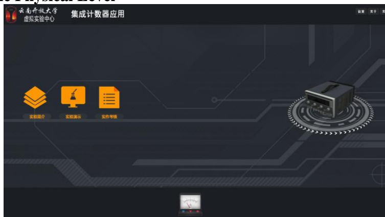
Fig.6. Physical level experimental case: integrated counter application virtual experiment