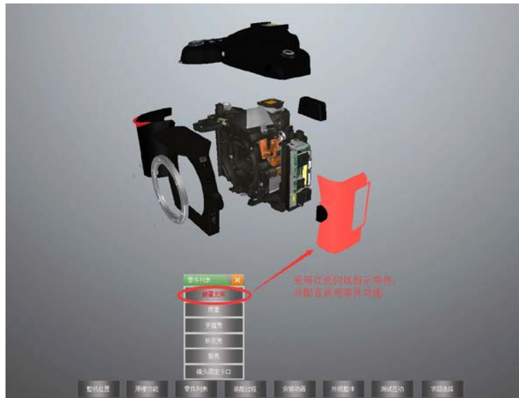
Fig.8. Experimental case of special effects: virtual assembly experiment of SLR camera

As shown in Figure 8, when learning the components of a structure, components are usually noted, or individually displayed, and in the development of this project, the special effects of dynamic mapping are adopted to facilitate the learners to clearly understand the results and position relations of the introduced parts.