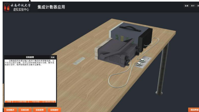
Fig.3. Experimental case of perceptual level: integrated counter application virtual experiment

The realization of perceptual Level focuses on two parts: Text interpretation and dubbing. As shown in Figure 3, in this experiment, the experimental principle is not only about the animation of the experimental principle, but also about the interpretation of the text and the explanation of the sound, which enables learners to acquire knowledge more easily and efficiently so as to achieve personal satisfaction.