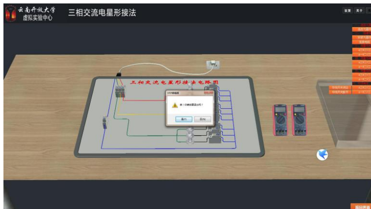
Fig.5. Cognitive level experimental case: virtual experiment of three - phase AC star connection

As shown in Figure 4, learners can independently explore the role and use of components, and when the operation goes wrong, the experiment will have an error message informing the experimenter of the error. At the same time, the system will pop up the undo, return, and re-execution buttons, meeting the needs of learners who wish to undo, return, and re execute. And it realizes the reversibility, fault tolerance and other functions of the cognitive level interaction design.