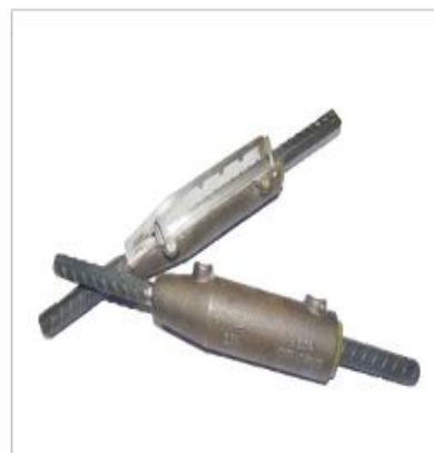
Fig. 6 half grouting sleeve

According to the manufacturing process ,sleeve is divided into casting sleeve and mechanical processing sleeve [1]. Appearance of the sleeve should meet the following requirements: the surface of casting sleeve should not have the defects including slag, sand holes, porosity, cold insulation, crack and so on ,which affect the quality of using performance. The surface of the mechanical processing sleeve is not allowed crack or other defects that affect the performance of the joint. The edge of the sleeve and the outer surface should be without sharp edges, burrs.