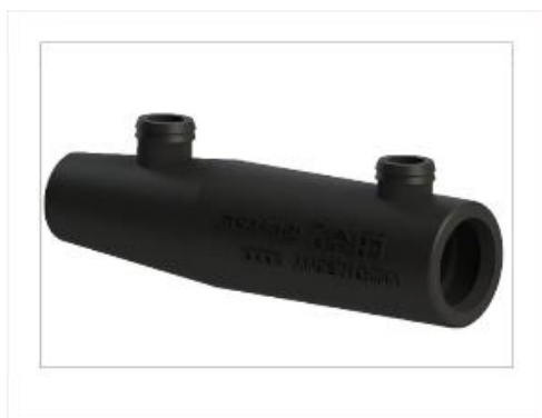
Fig.7 "concrete" brand ductile iron sleeve

At present, in terms of material, the sleeve include ductile iron sleeve (fig. 7) and steel sleeve (fig. 8).