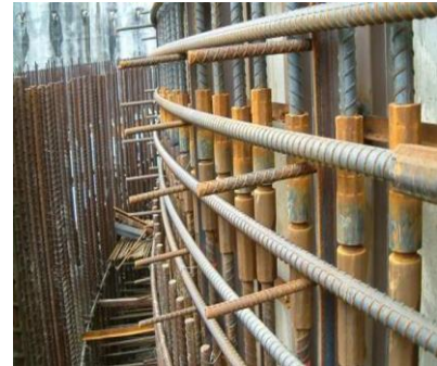
Fig.3 mechanical connection