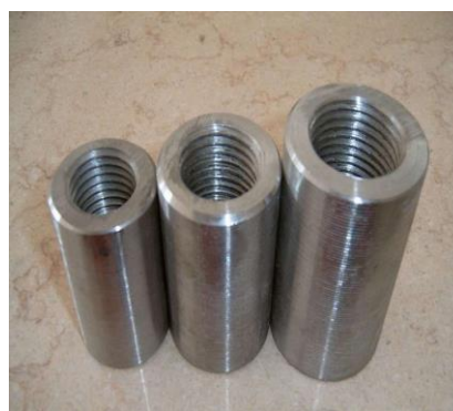
Fig. 8 structural steel sleeve

Sleeve by manufacturing process are prior to using ductile iron. And the sleeve by mechanical processing should use quality carbon structural steel, low alloy high strength structural steel, alloy structural steel or other type of steel which tested conform to the requirements.