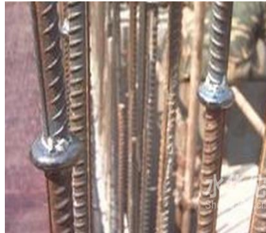
Fig.2 welding connection