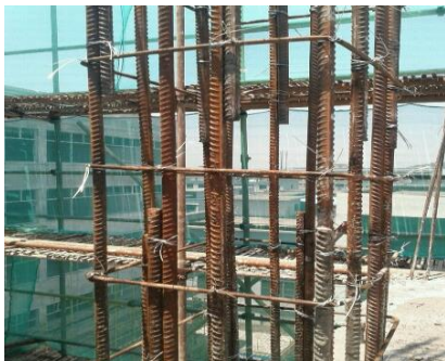
Fig.1 bundle connection

Mechanical connection (Fig.3) is a new way of steel bar connection, which transfer the force through the sleeve between two steel bar. Main methods of mechanical connection : radial and axial extrusion bonding, taper thread connection, upsetting straight thread connection, rolling straight thread connection and so on. According to the present development situation, especially in the mechanical connection, steel stripping rib rolling straight thread is the main.