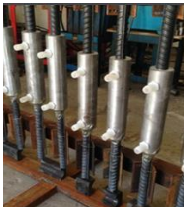
Fig. 5 full grouting sleeve