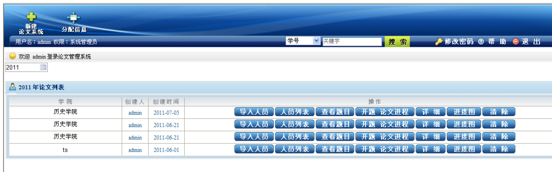
Figure 2. The main interface of the reviewer function

theses and put the theses into the database. When all papers submitted by teachers are shown, the reviewer will check the specific requirements and instructions of the paper and review whether the papers meet the requirements. If approved, it will be published, but the paper which is in the released state will not be released. Teachers and students can only see papers published by reviewers when they log in. The fourth one is to put the defense record and results into the database. After the defense, the reviewer will put students' results into the database and engrave the relevant materials of students' theses on the CD. Then the reviewer should upload the defense record to the specified folder in the form of Word documents and record the relative path of this file to ensure the download and facilitate the future inspection of students' defense record. The fifth one is the query statistics. This function mainly achieves the query of the defense record and defense results of students' theses, and the statistics of the number of students guided by teachers. The teacher who guide the excellent papers will be given the allowance and the data can be checked in the software.