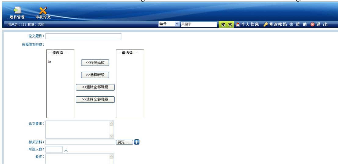
Figure 3. Teachers function interface

The teachers have achieved the following functions. The interface is shown in Fig. 3.