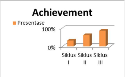
Figure 1 Increased Student Interest and Achievement

Based on Figure 1, it can be concluded that high student interest in cycle I is only 45% (14 students), in cycle II 65% (20 students), and III cycle to 95% (29 students). On student achievement in cycle I only reached mastery of 32% or 10 students from 31 students. Cycle II completeness of student achievement rose to 61% or 19 students from 31 students. Cycle III rose to 85% or 26 students from 31 students.