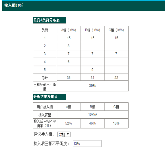
Figure 2 calculation of three-phase unbalance