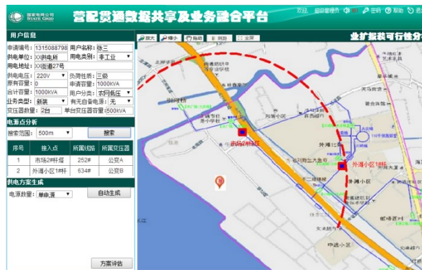
Figure 3 search result

Secondly, according to the location of the user map, search the power location of this high voltage special user. For the user of high-voltage special transformer, special transformer should be selected. It is a special transformer. The transformer is purchased by the user and is user's assets. Special transformer users mainly search nearby tower and cable branch box. Searching result is shown as figure 3;