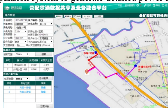
Figure 4 Power supply path

Route should be generated according to location and access point, also take GIS planned route into consideration. Crossover and circuitous should be avoided. Then click the auto generation in marketing and industrial expansion system to generate detailed power supply scheme.