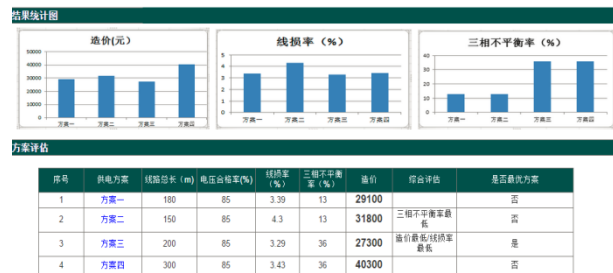
Figure 8 System design scheme

Evaluation was constrained with project cost, line loss ratio and voltage quality ratio, shown as figure 8