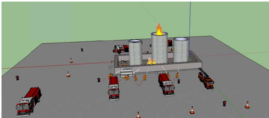
Figure 2 Three dimensional display of fire-fighting plan

After the modules are finished, they can be combined and assembled to carry out the corresponding fire-fighting plan. See figure 2.