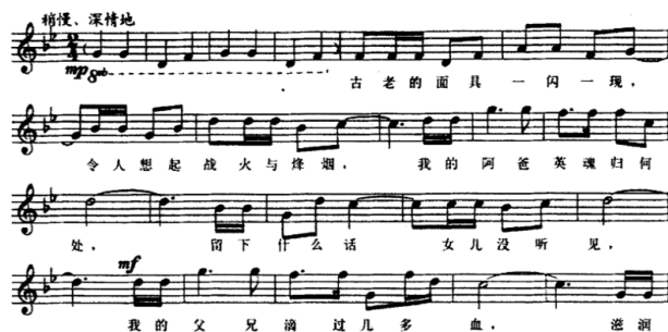
Fig. 1. Ejiamai's main theme of the melody.

In the first paragraph, the prelude starts with slow and long tunes and the music material is from Ejiamai's main theme of the melody. From the lyrics "ancient mask flashes/ reminiscent of war and beacon/ where's my father's soul/ leaving what words his daughter did not know/ my fathers and brothers waded how much blood/ moisten the crops and lit the mountains", We could feel the sorrow and the tragic atmosphere. The music increased the use of small segmentation and by using the first eight and then sixteen and then weak start along with long tone and other rhythmic form accompanied by the wave of melody, it expresses the far-reaching worries and helpless talk of Ejiamai in "Fig. 1"