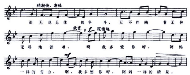
Fig. 2. The middle of Ejiamai's main theme of the melody.

Then, the melody goes into the middle of the song, which is made up by three phrases. In the first phrase: 25-33 section, the melody becomes dense, accompanied by the texture of the chord into the chord, with the volume enhancement, the speed becomes faster, depicting the mood of Ejiamai in the face of the struggle between the two groups and her suffering from anxiety. In the second phrase: 34-54 section, the melody rushed to the highest point, with accompaniment mainly the arpeggios, then the music relaxed, making the emotional catharsis to reach the vertex, and then gradually fall back to the music in the low area. The ingenuity of music depicts Ejiamai's changing feelings from anxiety to inner talking very well in "Fig. 2".