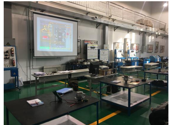
Fig. 2. The classroom used in new teaching mode

Theory and practice integration means that the barrier between the theory teaching and practice teaching in the conventional mode is broken and the theory and practice learning mix together organically. The classroom is moved to the workshop rather than the conventional classroom. The typical classroom in the new teaching mode is as shown in figure 2.