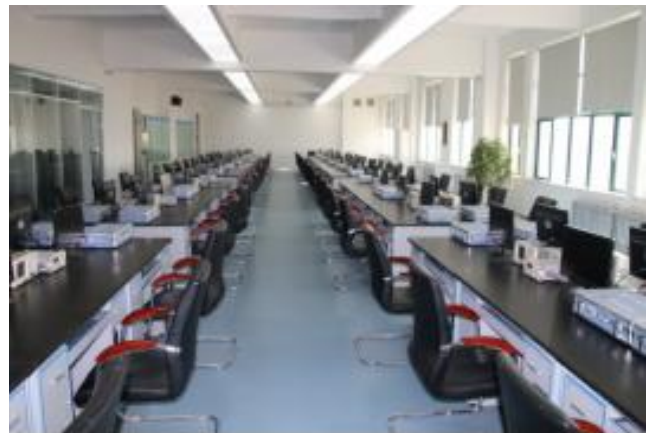
Figure 1. The environment of blending teaching classroom

The course of "EDA Technology" reflects the rapid development of electronic information and chip integrated manufacturing and has a strong sense of the times. The modern electronic technology reflects the advanced, systematic, comprehensive and practical. At the same time, the course is still an important part of the link with many course such as "digital electronic technology" and "microcomputer principle and interface technology". Understanding the theoretical and practical knowledge in this course will help students to understand the combinational logic circuits, timing logic circuits, and state machines in "Digital Electronics" and timing, memory, and LED digital tube dynamic scanning principle in "Microcomputer Principle and Interface Technology" The course will also help students design their own electronic products that have functional and innovative. So we organize 40 students from electrical engineering and automation professional to have "EDA Technology". Our lab is shown in Figure 1. The experiment box used in this course is shown in Figure 2