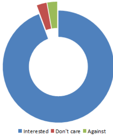
Figure 3. The charts of teaching feedback statistics