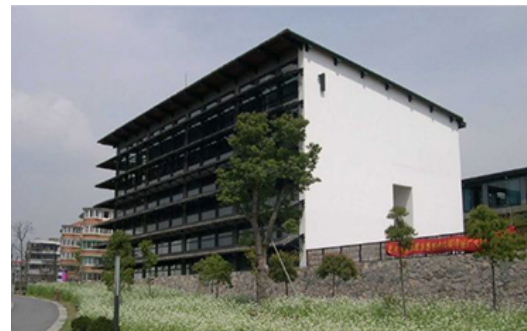
FIGURE VI. WEEDS IN XIANG-SHAN CAMPUS