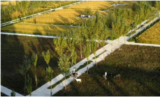
FIGURE VII. SHENYANG CONSTRUCTION UNIVERSITY CAMPUS LANDSCAPE