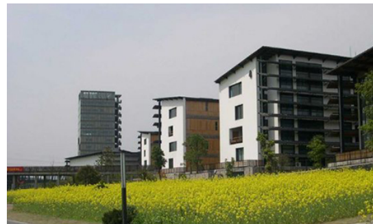
FIGURE V. RAPE FLOWER FIELD LANDSCAPE IN XIANG-SHAN