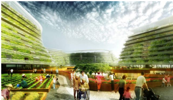
FIGURE II. SINGAPORE CITY MUSIC FARM RENDERINGS