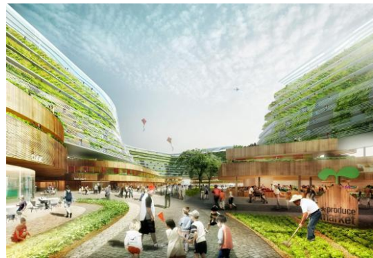
FIGURE IV. SINGAPORE CITY MUSIC FARM RENDERINGS