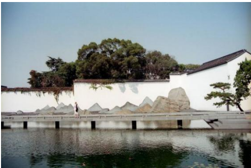
FIGURE I. SUZHOU MUSEUM FORGET ROCKERY

The same is true of poetry and painting: painting is physical poetry, poetry is intangible painting. Chinese poetry and painting culture has a long history. Song poet Su Dongpo's poem "Little Mausoleum invisible paintings, Han Dan painting without poem" reveals a "poetry containing painting, painting full of poem" dialectical thinking. The principle of the design of poetry and painting is to use the thoughts of "leaving the white, the artistic conception, the charm and the imagination" in poetry and painting, and to surpass the dull landscape reappearance by absorbing the thoughts of poetry and painting in the design. In landscape painting, the pursuit of endless resembling between idyllic landscape and traditional poetry and painting. For example, the Suzhou Museum is a very successful one "see the rockery" landscape, inspired by the landscape painting of MiFei, using the traditional Taihu stone to be the brush, the wall to be the baseboard. The mountain and lake match each other and full of vigor. Figure 1.