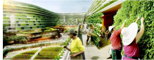
FIGURE III. SINGAPORE CITY MUSIC FARM RENDERINGS