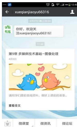
Fig. 1. Pre-class learning content push.

In the pre-class teaching preparation, teachers will send learning content requirements and reference materials to student's mobile phone through the WeChat official platform, as shown in "Fig. 1". Even in the dormitory or in the washroom, students can prepare for the class in advance by learning the relevant materials. As for the confusions in learning process, students can seek help from online resources or WeChat official platform on which students can interact with teachers. Through this learning mode, students will not only make full use of time but also improve their learning efficiency.