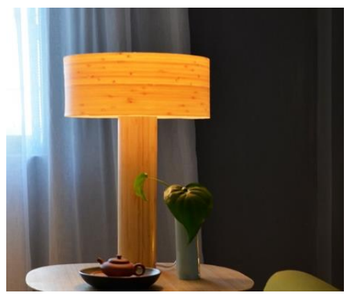
Fig. 10. The table lamp with sliced thin bamboo cover.

Sliced thin bamboo, also known as bamboo skin, is a kind of patch material, which is processed by slicing machine for the bamboo plate. Sliced thin bamboo has a brittle texture, easy to be damaged, and has low strength, so it is often mixed and cohered with non-woven fabric to strengthen the structure, which can make up for its vulnerability and enhance the horizontal tensile strength, and then it can be spliced into a large margin of sliced thin bamboo. Due to the limitation of bamboo skin, the bamboo lamp needs to be glued to the frame during the production of bamboo lamp, and the frame provides the support for the material as shown in "Fig. 11".