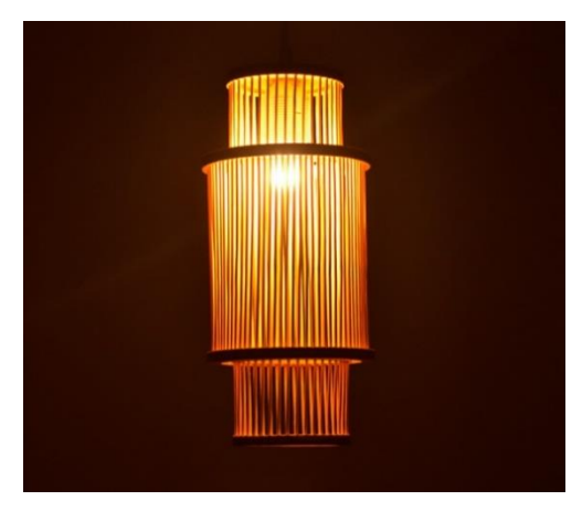
Fig. 6. The bamboo lamp based on straight line.

In the writings of ancient Chinese literary, bamboo is a symbol of a gentleman, with the cultural connotation of integrity. In the design of bamboo lamp with straight line as element, the straight line not only becomes the main elements of the form, but also makes a close combination of the design with the image of a gentleman in Chinese culture. Therefore, in the design of bamboo lamp with straight line as element, the shapes mostly have a strong Chinese flavor as in "Fig. 6" to achieve the integration of "shape" and "state", and by the visual symbols generated by "shape", people are encouraged to feel the spiritual connotation of design.