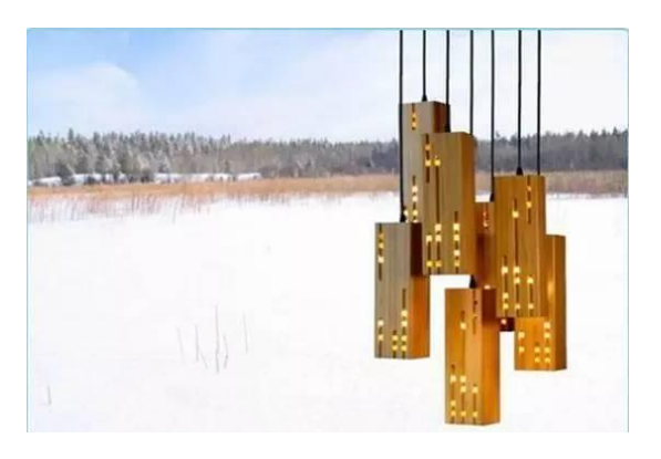
Fig. 5. Hollow chandelier spliced by bamboo plates.