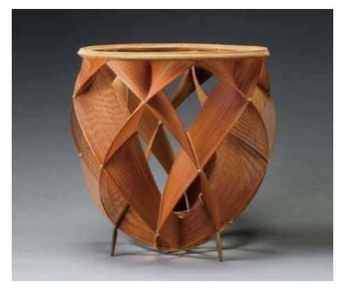
Fig. 9. The bamboo wire table with large curvature.

Different line elements have their unique emotional expression, giving a different psychological experience. The line elements of bamboo include many varieties, such as bamboo wire, bamboo slice, and raw bamboo, which can form line element by different processing. Combined with the principle of formal beauty, the bamboo lamps designed with different line elements have various ways to achieve the technology of production [7].