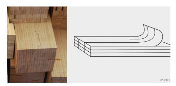
Fig. 11. The sliced thin bamboo craft.