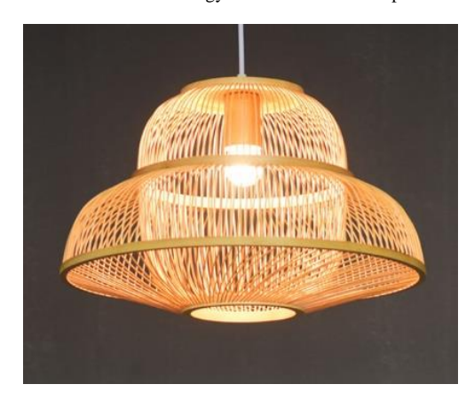
Fig. 8. The curve-type bamboo wire lamps.