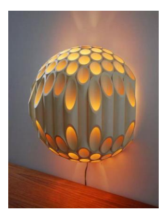
Fig. 1. The bamboo lamp by turning process.