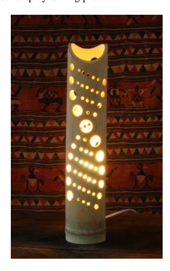
Fig. 2. The bamboo lamp by hollow processing.