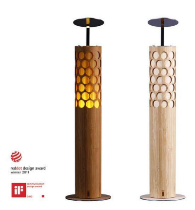
Fig. 4. Bamboo Moon Lamp.

The production process of artificial bamboo lamp is closely connected with the achievement of product design form. Based on pursuit of the design effect, the convenience of production process plays an important role in the production and use of the product [3]. The appropriate technology can achieve the precise expression of the shape, fully reflect the beauty of the product composition, and present the designer's aesthetic taste.