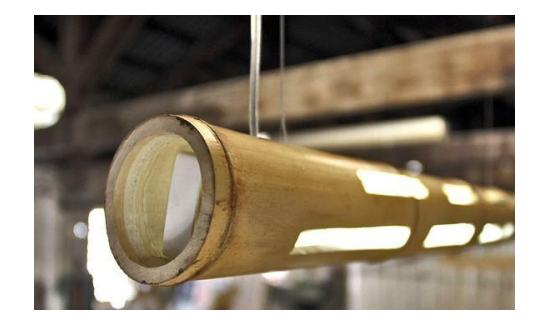
Fig. 14. Raw bamboo lamp.