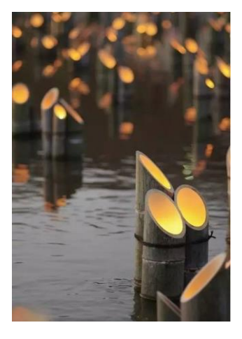
Fig. 3. The arrangement of bamboo lamps and lanterns.

Taking the completed bamboo tube as the basic element, connect some luminous bamboo tubes together by gluing, bundling and other combining type, to bring the designer's ideas into reality, meeting the lighting requirements of lamp design and making bamboo lamp design have more practical value.