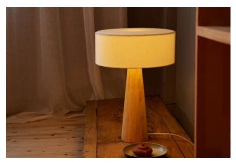
Fig. 13. Bamboo plate lamp.

Stereo is formed by movement of faces, so the stereo has its data determined and quantified in the three dimensions of length, width and height. In the design of bamboo lamp, the support structure is an objective reflection of stereo element. In the production process, there are two main sources of support structure. One is turning of bamboo plate as in "Fig. 13", the other is the use of raw bamboo "Fig. 14". It is noteworthy that in order to achieve the vertical support structure, natural bending of raw bamboo can be straightened by reverse bending after heating, to achieve the aim; and for the necessary bending support structure, it is also achieved by thermal bending.