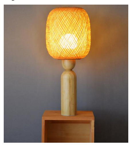
Fig. 12. Multi-layer bamboo table lamp.

Densely arranged bamboo wires and bamboo weaves can be used as cover of lamp by the manual gap control, which can reduce the discomfort for direct exposure of light source and can form mottled light and shadow, bringing bamboo lamp more lingering charm.