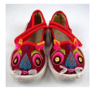
Fig. 4. Yi's tiger head shoes.