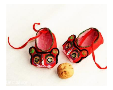
Fig. 7. Sincere and natural.