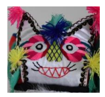
Fig. 2. Shandong tiger head shoes.