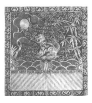
Fig. 10. Qing-dynasty flying tiger pattern Kesi.