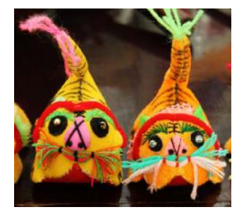
Fig. 3. Han's tiger head shoes.