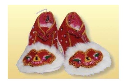
Fig. 5. Bai's tiger head shoes.