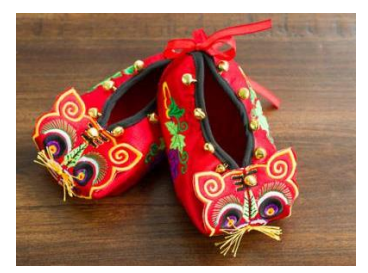
Fig. 6. Typical.

"In folk art, women's fabric products, embroidery, paper-cut and other designs, follow the idea symbolized by the metaphor, and are subject to the wishes of happiness and luck..."[5] the symbolic performance can be found everywhere in the design of tiger-head shoes, and the images of double dragons, double phoenix, gourd, bats, peach and others are often used to create various tiger images. These visual images are used to express people's wishes, for children expectation and for family harmony, and to carry people's spiritual ideas, endowed with the color and spirituality of life in "Fig. 8".