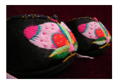
Fig. 8. Metaphoric.