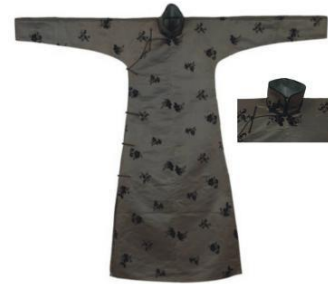
Fig. 1. The cheongsam with yuanbao collar which was collected in the clothing museum of Beijing Institute of Clothing Technology.

wearing collar height can cover both the gills and earlobe costumes, although such collars bring inconvenience to the twisting of the head, in order to pursue fashion and beauty, many women also want to "wrap" these so-called "fashionable clothes" to show their strange scenery[4]."