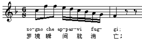
Fig. 10. Extracted from O crudel the il mio pianto.