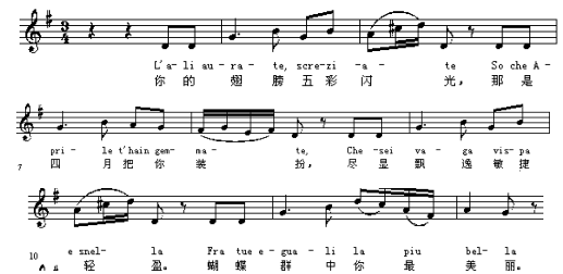
Fig. 19. Extracted from La farfalletta.