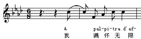
Fig. 25. Extracted from A palpitar d'affanno.