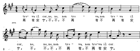
Fig. 23. Extracted from Torna, vezzosa Fillide.

In Bellini's art songs appear many arpeggio melodies which are carried out within tierce or fourth interval. It gives the melody a sense of leap and life. The music is gentle and lyric. For example, the works include Torna, vezzosa Fillide, Quando incise Stl quel marmot, A palpitar d'affanno, Vanne, O rosa fortunate and La farfalletta as in "Fig. 23", "Fig. 24", "Fig. 25" and "Fig. 26".