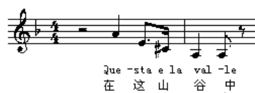
Fig. 24. Extracted from Quando incise Stl quel marmot.