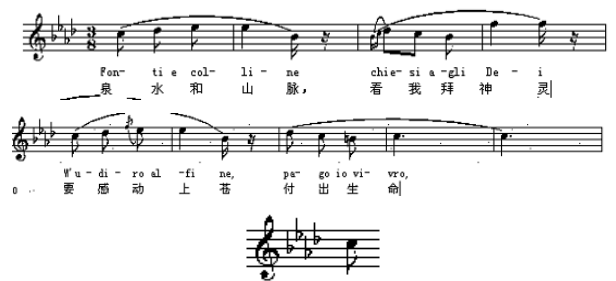
Fig. 6. Extracted from Malinconia, Ninfa gentile.