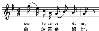
Fig. 26. Extracted from Vanne, O rosa fortunate.