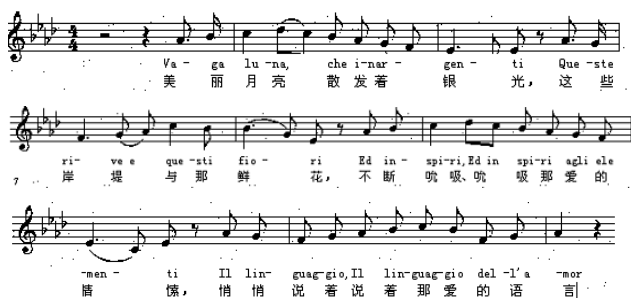
Fig. 5. Extracted from Vaga luna, che inargenti.