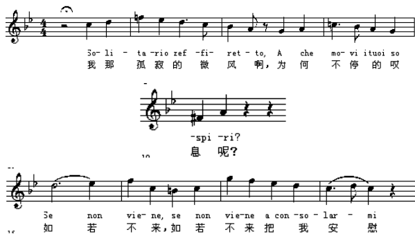
Fig. 4. Extracted from L'abbandono.

Secondly, the melody of Bellini's art songs is often connected by several vaulted melodic lines, showing a form of rolling wave, like a long-flowing stream. The waved melodic line is very uniform and balanced: a descending melody follows an ascending melody; then follows another ascending melody continuously. In addition, the length and height of the ascending melodic lines and descending melodic lines are quite similar. The melody is carried out in a graded and smooth way, forming a balance and regular state. This gives a sense of ease, regularity, balance and flow. With classical style, it is very elegant and romantic. The waved melody appears ups and downs, long-stretched, broad and grand. For example, the works include L'abbandono, Vaga luna, che inargenti and Malinconia, Ninfa gentile as in "Fig. 4", "Fig. 5" and "Fig. 6".