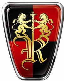
Fig. 3. ROEVE auto logo.

We are in the time of Made in China, it is urgent for develop a national brand. At the beginning of Chinese reforms, most of Chinese auto logos designs borrowed or copied famous auto brands, and the auto logos with the same animal images could be found everywhere. The development of national brand has to be based on our cultural origin, showing the self-confidence of culture, considering the long term brand development according to the time tide, and combining modern design with traditional Chinese cultural elements for inheritance and innovation.