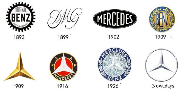
Fig. 2. German auto Mercedes-Benz logo evolutions.

Except Peugeot auto, the world famous German auto brand Mercedes-Benz logo three-pointed star also has a long story of evolution, which is another typical case. Mercedes-Benz was established through the merger of a company owned by Karl Benz, father of auto, and a company owned by Gottlieb Daimler in 1926 in "Fig. 2".