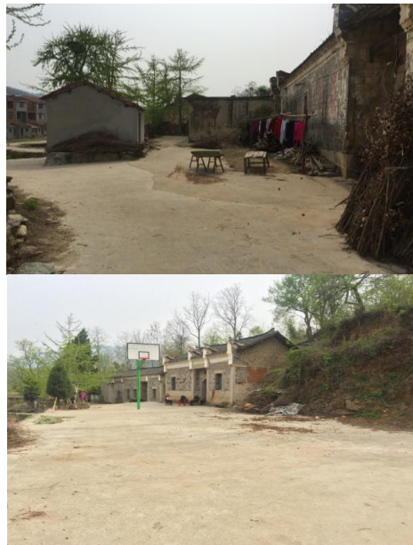
Fig. 4. Contact space near house.

2) Space with moderate distance from house : Space with moderate distance from house refers to the public contact space which is inside the housing cluster in the village but not adjacent to the houses, with abundant types. Dotted contact space centered on ancient trees, well platforms, bridgeheads, street intersections and house entrances, large space such as square in front of temples, square at village entrance and ancestral hall, all belong to the space with moderate distance from house. These spaces are open, with pleasant natural landscapes, architectural landscapes and cultural landscapes, and they often attract villagers to stop here. Ordinarily villagers in Xiangyang Village often gather under trees, by wells and on street intersection, which become popular activity spaces in the village. Open spaces such as square in front of temples are usually used to hold weddings, funerals, rallies, festival celebrations and other large-scale traditional folk activities, which are important contact spaces for villagers to carry out spiritual and cultural exchanges and consolidate relations with acquaintances. There is a large open space in front of Yang's ancestral hall in Xiangyang Village, where the villagers thresh, sun grains and peanuts, besides, large-scale public events, decision-making, banquet and weddings are all held here, which is the largest public activity space "Fig. 5".