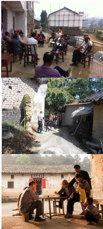
Fig. 8. Spontaneous activities.

3) Social activities : Social activities are combination and evolution of necessary activities and spontaneous activities. They depend on various activities involving others and are also affected by the physical environment of external space. Social activities have high requirements on the quality of space, and generally require a lot of people to participate in. Activities in which only a few people participate can only be called spontaneous activities. In social activities, people generally communicate and feel others by listening and seeing, with a certain degree of passivity and chain. Such activities include large-scale folk activities such as village gatherings and weddings. In Xiangyang Village, villagers' gossiping, chatting and other small-scale social activities are the most common, and people take care of children, play chess, greet each other to kill times, whole traditions folk activities such as rituals are rarely seen in Xiangyang Village nowadays. Only activities such as weddings and rallies can be seen, but they are all different from the past.