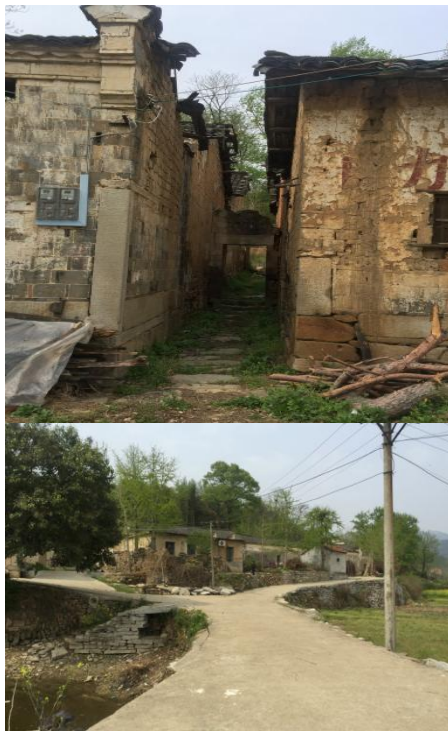
Fig. 2. Street and alley space.

1) Street and alley space : The existing streets and roads in Xiangyang Village are divided into three levels: the first level is the roads connecting the village and the outside world, and the only main road was formally built with cement in 2008; the second level is mainly the internal roads connecting various construction groups inside the village, which is also the most important and characteristic street space in the inside the village, generally in east-west direction, and there is a stone path along the stream, which used to be the main road to the village before there was the main road; the third level road is the narrow gaps between residential buildings, mostly made of flagstone through simple paving, which can only meet the function of "passing", and basically has no room for people to stay, but it can provide a certain passenger flow, giving people a certain degree of convenience. Alleys change according to the orientation of buildings in different shape and size "Fig. 2".