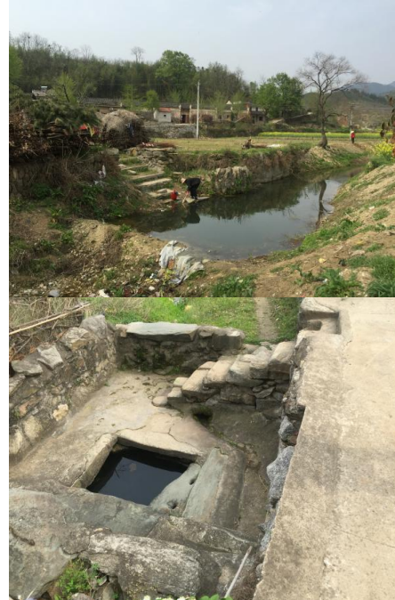
Fig. 3. Water system space.

2) Water system space : Xiangyang Village's main water system is divided into two parts. A part of is the river, and the other part is the tap water. There is a mountain spring flowing from Dawu Mountain in the village, which is the main source of domestic water and irrigation of farmland in the village, and the water for residents of the ancient village was mainly from the ancient well beside the road, piled by square stone, with water surface of about 1 square meter, shared by a few households. In modern time, every household has a well by their house, and mainly use underground well water "Fig. 3".