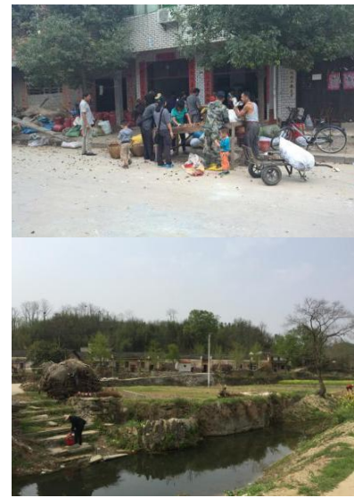
Fig. 7. Necessary activities.