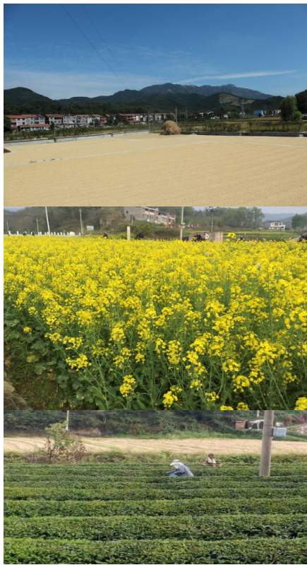
Fig. 6. Contact space far from house.