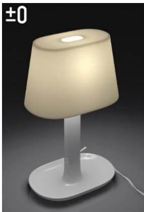
Fig. 3. Light with Dish ±0.