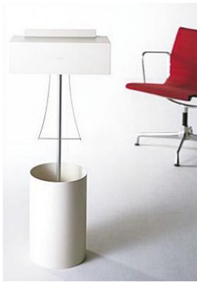
Fig. 2. Printer EPSON.