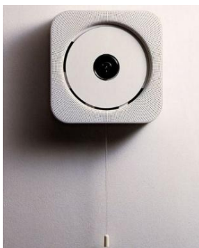
Fig. 4. CD Player for MUJI.