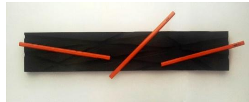
Fig. 5. Pen box for B&B.

In the environment and things, it is allowed to bury the unconscious function, which is a way of Naoto Fukasawa to present the unconsciousness. This approach provides a possible space for behavior, but it is not mandatory or catered to. Naoto Fukasawa looks for the potential relationship between man and the environment, subtly designs the elastic space, and maintains the potential relationship by free adjustment of human and environment. The pen box in "Fig. 5" he designed for B&B is a typical example of this. When we put the pen on desk after use, it is usually an optional behavior without thinking. Naoto Fukasawa designed many interlaced grooves on the box in order to fit the unconscious placement behaviors.