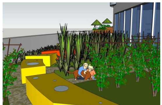
Fig. 8. Student works: Design of climbing frame in the planting pool and the layout between the border and the landscape chair.