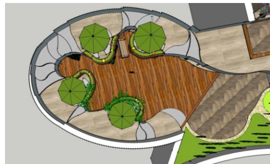
Fig. 2. Student works: Map of the “sky garden” leisure zone on the roof of the campus dining hall.

During the facade and the node designing, the entrance area, the leisure area, exhibition area and special service area of “sky garden” are attached great importance to, and distinctive as well. In the process of design, some sketches are aided, and corresponding node is supplied, as in "Fig. 2" and "Fig. 3".