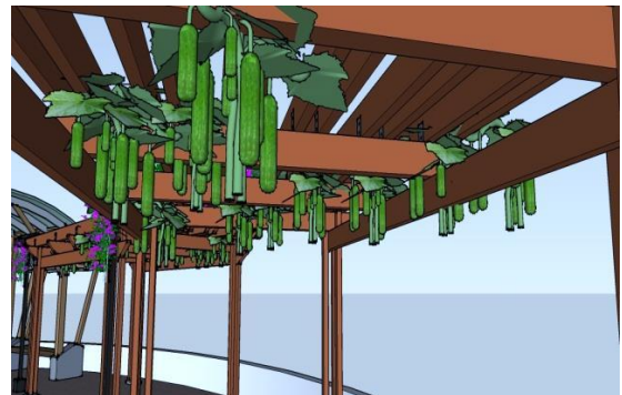
Fig. 7. Student works: Design and vegetable & fruit flower.

Finally, in the allocation of fruits and vegetables, “sky garden” has its particularity in planting. Its planting is mainly divided into two categories. One is vegetable and fruit type planting. The other is landscape planting. A clear awareness of the position, the proportion and the landscape requirements is applied into the two points above. Even the “sky garden” with vegetable planting as its main function should be designed according to some design principles of roof garden to ensure the beauty and appreciation of the “sky garden” over the city. The selection and collocation of vegetables can be considered in the plane structure, the planting area of vegetable color changing, scattered height, etc., as shown in "Fig. 7" and "Fig. 8". In accordance with the basic conditions of agriculture, designers give full play to the creativity and aesthetics, landscape ecology and other aspects of the comprehensive ability to apply knowledge and practice.