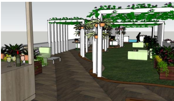
Fig. 5. Student works: Particle map II of special service area “water bar”.

Secondly, in all the landscape design projects, the application of sculpture is an important element, especially to highlight the features of a garden, or create a visual focus. If the weight of the sculpture does not exceed the bearing capacity of the roof, it can be used safely. The building act of San Francisco stipulates that 1% of the cost of public funded buildings must be used for art design. According to this rule, the SWA landscape design company takes sculpture as an important decoration when designing roof garden for the river terminal. Our sky garden also design landscape sketches that highlight the theme of the site, as shown in "Fig. 6", which is a landscape sketch designed for the theme of “1 Meter Garden”.