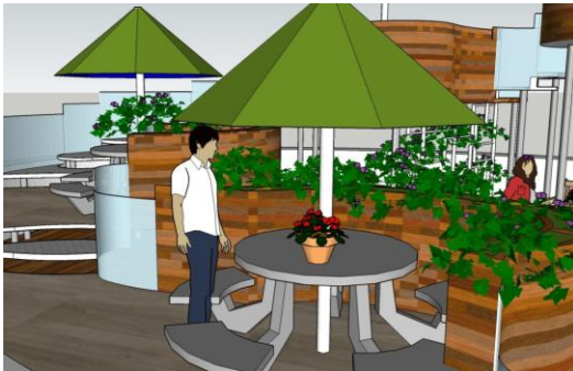
Fig. 4. Student works: Particle map I of special service area “water bar”.

hydroponics, farming devices, deciduous composting, animal home and so on. The deciduous compost area is a special storage area designed at a corner of the sky garden, collecting and storing fallen leaves and fermenting them as natural nutriment in the field. The animal house is similar to the honeycomb house and chicken house of Eagle Street rooftop farm in New York, USA. In our case we plan service area of “water bar”, as in "Fig. 4" and "Fig. 5".