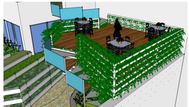
Fig. 3. Student works: Vertical space design of the “sky garden” leisure area on the roof of the campus dining hall.

In the planning of the special service area, the farming culture is integrated with the concept of environmental protection, and the sky farm is decorated with modern art. The “Soft decoration” of the farm includes vertical greening,