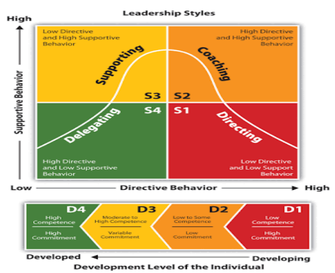
Fig. 2. The link between situational leadership and followers readiness

When it is related to situation theory from Hersey and Blanchard, this theory is focus on followers readiness as the key of situation that determine behavioral effectiveness of a leader is a teacher. This situation finally force teacher to ask their student to participate actively and give them motivation to grow optimally.by participating, student will be more confident in doing tasks given to them [15]. This shows that right leadership style shown that leadership style was hoped to be adapted with students' abilities and give good motivation so their discpline will increase. The link between situational leadership and followers readiness can be seen in figure 2.