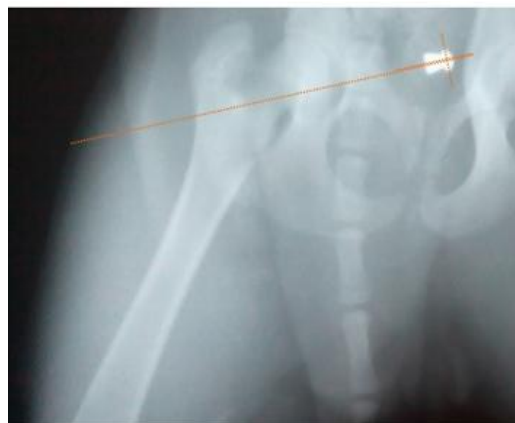
Figure.1: Estimation of trajectory wound from x-ray.