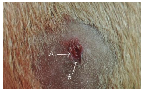
Figure.4: Comparison of the entry and exit wound at distance shooting (500 cm).