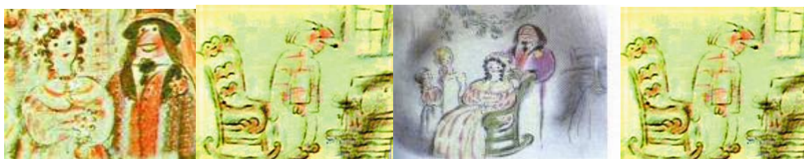
Figure 7 French animation "wooden rocker" screenshot

Famous French animation artist Fredrik Bach's work "wooden rocking chair", in order to show the complex atmosphere of the environment, fresh and bright, rich and exquisite color effects, finely depict the texture of the image texture with wonderful chalk creation means, Express its unique humane care.