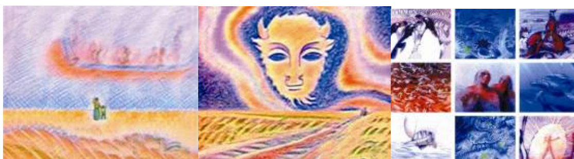
Figure 5 French animation "plain days" screenshot

Colored pencils can give the viewer a rustic feel of warmth, while the crayon's thick brushstrokes have a special, naive aesthetic. The three main creators of French animated "Plain Days" are represented by computer-simulated crayons while the "Frog's Fables" are drawn using crayons and oil swabs.