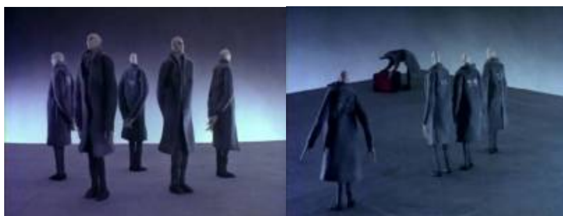
Figure 12 German animation "balance" screenshot

"perceived" created by the animator's thought after the infinite development. This kind of visual care is the multiple fusion of the form and meaning of the "creation environment". However, the representation of animations such as "philosophical thinking and rhyming into metaphysics" is also an expression of the imaginary and non-existent images. Deliberately breaking the norm and performing the exaggerated performance are the paradigms of the animated language. In the context of the animation context, the pragmatic implications of the animations contained therein are deduced, and the sounds outside the strings in this animation is illustrated and understood. This implicit non-direct way of expression, in some philosophical animations Often used. For example, the animated short film "Balance" made by Germany's twin brothers Christoph-Lawenstein and Wolfgang-Raustein, through a square plane suspended in the air, and five standing people The story between a music box, which contains the concept of the German community, the emphasis on stability, balance, the pursuit of a peaceful life, and the resistance to temptation and other ideas.