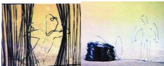
Figure 9 French animation "traveler's hoop" screenshot

Russian animation artist Balladin created the animation "The hit of the traveler" is created by the creators using steel wire.