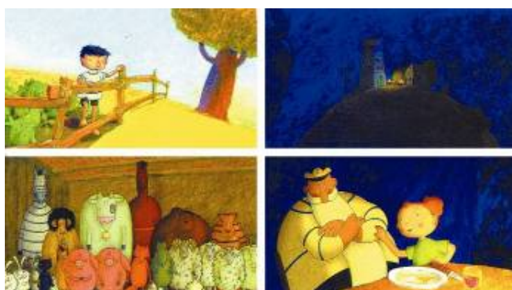
Figure 6 French animation "Frog's Fables" screenshot

Famous French animation artist Fredrik Bach's work "wooden rocking chair", in order to show the complex atmosphere of the environment, fresh and bright, rich and exquisite color effects, finely depict the texture of the image texture with wonderful chalk creation means, Express its unique humane care.