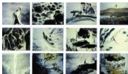
Figure 3 Chinese animation "Manifesto" screenshots

In creating the ink-style animated cartoon "Muti," artist Lee Ke-dyed drew 14 paintings of water buffalo and shepherd boy for reference. Hemingway's masterpiece "The Old Man and the Sea" made by Russia's Alexander Petrov is the artist's painterly paint on glass with finger paint.