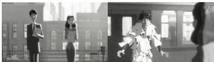
Figure 1 US animation "paper talk" screenshot

Animations are the artistic effects produced by industrial arts, such as art, synthesis of literature, painting, music, performance, photography and other artistic means. The animations are achieved through exaggeration, deformation, fantasy, fiction and surreal. The spirituality of the animation is that it has the wings of dreams and flies in the paradise of dreams. It surpasses reality and transcends life and has the artistic expression above the reality. The performance of people's lives, emotions, ideals, aspirations, its exaggerated expressive language can not be separated from the use of animations. The animated exaggeration is manifested in the non-realism of the creative technique, which is constructed through the unique language of the animation. For instance, in a paper animation entitled "Passion on Paper", which won the 2013 Oscars for best animated short film, the paper was given life and led the protagonist to pursue the exaggeration of love.