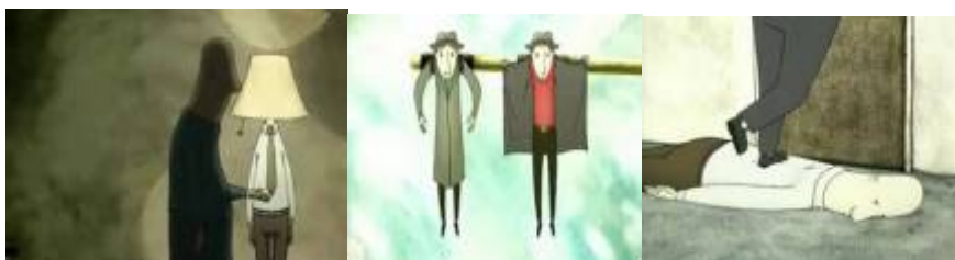
Figure 14 Argentinean animation "Hired Lives" screenshot

The charm of art animation is that it does not follow any fixed patterns, formats and techniques for the exploration of the nature of animation art, with its own unique language expression system. Zhuangsheng Taoism with the naturalistic colors; "Kunpeng wings" beyond the freedom of the space shown in his; without losing the true, leisurely noble spirit of temperament; exudes life philosophy and aesthetic experience of the comfortable atmosphere, Open the door of creativity for us to create animation dreams, to build an animated home for thought-taking. Take us to realize the meaning of life that "heaven and earth merge with me and everything is one with me." Animations need to go beyond the conventional imagination and unique artistic creation to create unique aesthetic experiences that are animated. Animations are the most free form of communication. There are no objective restrictions on performers, cameras and cameras. They find room to breathe in the "illusionary experience and life experience." They are able to express their omnipotence and make our life new.