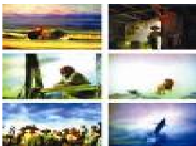
Figure 4 Russian animation "The Old Man and the Sea" screenshot

Colored pencils can give the viewer a rustic feel of warmth, while the crayon's thick brushstrokes have a special, naive aesthetic. The three main creators of French animated "Plain Days" are represented by computer-simulated crayons while the "Frog's Fables" are drawn using crayons and oil swabs.