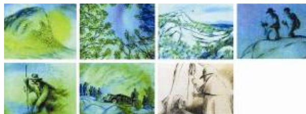
Figure 13 Canadian animation "tree planting shepherd" screenshot

as Jill Deleuze said: "The purpose of art is to distort perceptions from the perception of objects and the state of the subject of perception, State transition to another state of feeling to distort the feeling: to abstract the feeling of agglomeration, the formation of the pure feeling of pure. "Such as the Canadian animated master Frederic Back << tree planting shepherd >> about the lonely shepherd With its own power, it took decades to plant large stretches of woods in the desert and turn the mound into an oasis, giving the viewer poetic aesthetics and fluidity.