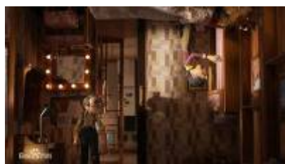
Figure 2 British animation "head-down life" screenshot

Animation language is the fantasy brush of animators, through the conciseness of art at multiple levels such as formal language, image language and implication expression. Regardless of the animation modeling language, the animation narrative language and animation language have the characteristics of virtuality, narrative performance, generalization, exaggeration and sports rhythm. Animation art with its unique image to create, people feel fresh and interesting. That is because those who through the artist's fantasy to create all kinds of animated images are all human nature and human enrichment, refining, exaggeration and sublimation, on a real basis into the dramatic creation. But not all distinctive personality, and some even very vague, the animated world is not necessarily the clear and clear soul hometown. Pure and warm are not unique charm of art animation, in the simple and warm from time to time will hide the dangerous and heavy meaning. Animated themes, manifestations with the development of society, become more and more diverse. No matter the image is created, the theme is set, the picture style does not have certain rules. For example, in the head-down animation of head-to-head animation directed by Timothy Rupert, a British director and screenwriter, actor Walt lives on the floor while actress Machie lives on the ceiling. This exaggeration the full expression of drama embodied in the animation vividly.