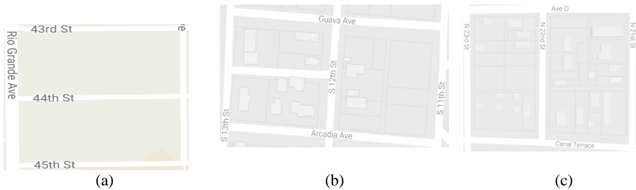
Fig.1 Maps of typical communities

We picked three communities out of three towns in DeFuniak Springs, Orlando, Fort Pierce, FL and got their floor map on Google Maps is shown in figure 1.