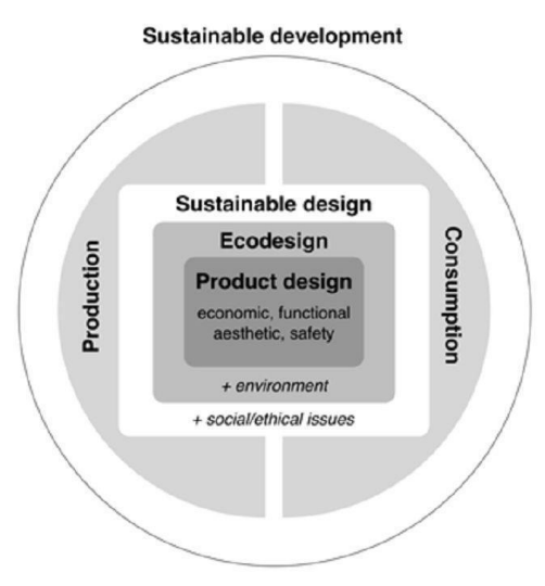
Figure 4. Correlation between eco-design, sustainable design and sustainable development

"Sustainable Product Design (SPD) is more than Ecodesign, as it integrates social and ethical aspects of the product's life cycle alongside environmental and economic considerations, aiming for the so-called 'triple bottom line'. Sustainable product development and design is concerned with balancing economic, environmental and social aspects in the creation of products and services."