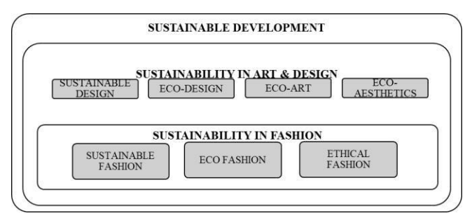
Figure 3. Diagram of Discussion Sequences

To elaborate all concepts that discuss the eco-friendly development in fashion, in order to be focused and get a proper direction of discussion, therefore, concepts will be discussed is from that is global to that is specific in fashion. Diagram of the discussion order is as follows: