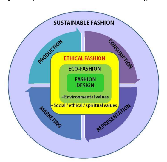
Figure 5. Diagram of correlation between ethical fashion with ecofashion and sustainable fashion.

Based on the comparison study of eco-friendly design concepts in fashion, which has been put in order from the most global to the most specific concepts, therefore, a conclusion of comparison analysis and correlation of eco-friendly concepts in fashion is stated in below diagram.