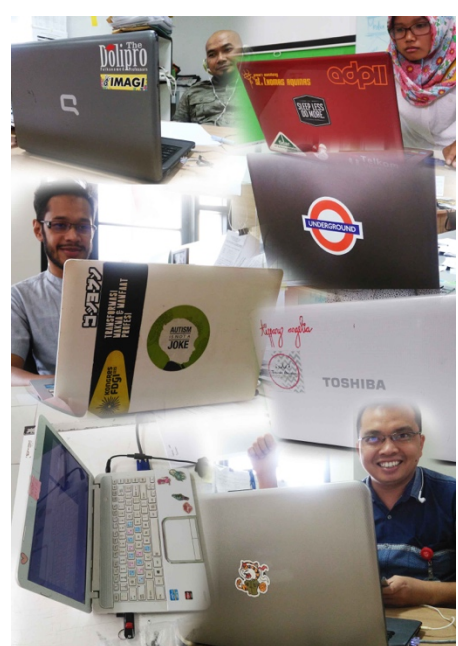
Figure 1 The Usage Stickers on Laptop in Telkom University

of "Attractive, Colorful, and Fun" Because of their prefabricated laptops are way too boring for them?