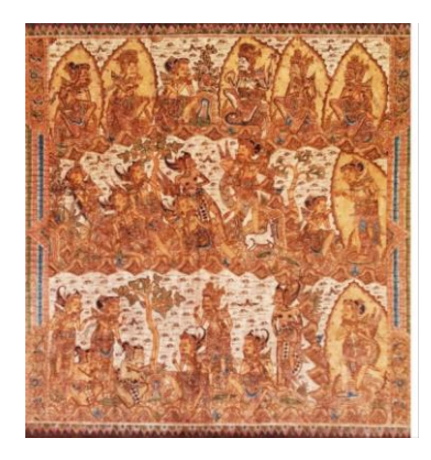
Figure 1. Mahabratha " Pandawa Swarga"

the bottom. Surely not so panel based only on the order or in the relief called the layers. As an example, we see in one of the Kamasan puppet paintings taking the Mahabratha story in the "Pandawa Swarga" story.