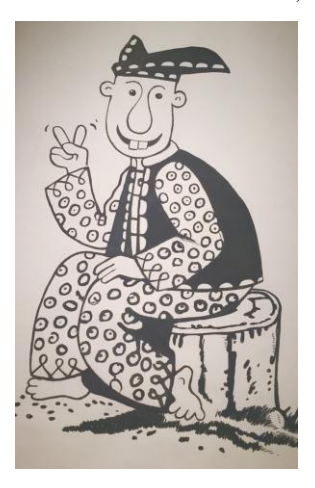
Figure 1: Original Malay comic by Rejabhad