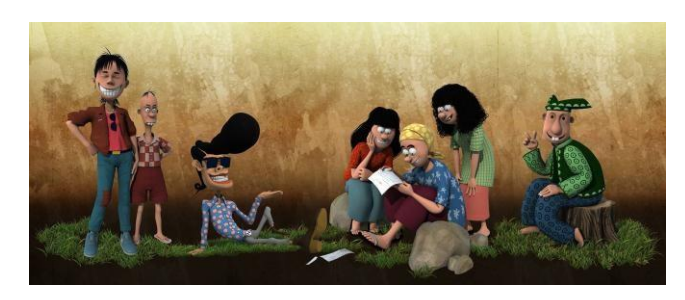
Figure 4: Malay Comic Design in 3D modeling

To design and modeling the comic character with their costume, the modeler uses its UV layout on planar mapping. By sculpting the costume would be too timeconsuming. The Syflex plug-in is used when modeling for the texture costumes design. With Syflex, attribute pre-sets are used to determine a starting point for the simulation but the configuration may be tweaked to the desired results at different character design. For example, the body of the character is determines as a collision object to simulate further details to produce a pair of cloths or pants on the each comic character. The most difficult part is capturing details of the cloth and pant textures. Generally, the simulation process hence involves paying great attention to details, as there are lots of patterns and textures to be simulated. However, some simple technique using paintFX through ready-made brush in Maya software can be used for this purpose.