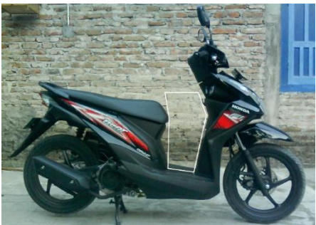
Figure 7 Simulation of product placing

From variety of brand and size of scooter, there are some standard that can be used as reference to place the product; distance between two feet, distance between arms and handle that was used as reference in design a motorcycle, especially at the middle part of scooter.