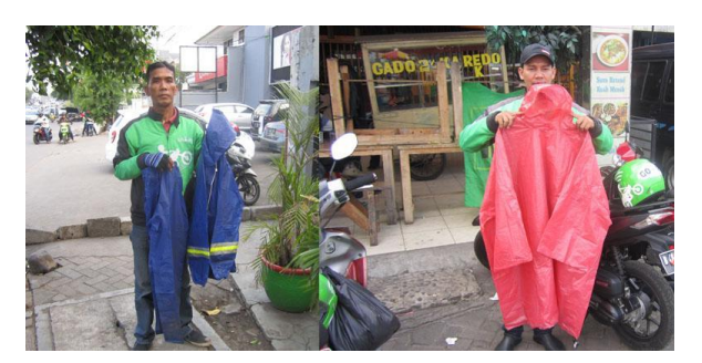
Figure 1 Biker with poncho raincoat

Biker is really depended on weather. It really affects their activity if the weather is rainy. For biker, rainy situation could be anticipated by using poncho raincoat. Poncho raincoat could protect the body but not the luggage they bring. Alternatively, some people choose to wear their bag first before using raincoat. But there are also people who prepare plastic bag for rainy situation.