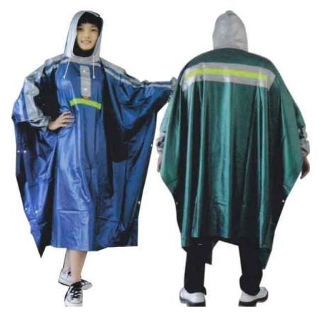
Figure 2 Poncho raincoat that often used by biker