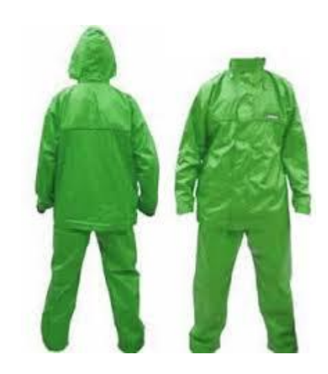
Figure 3 Jacket raincoat that often used by biker