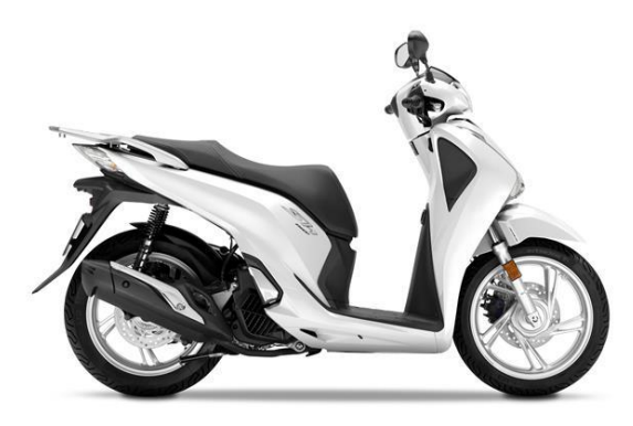
Figure 4 Side view scooter