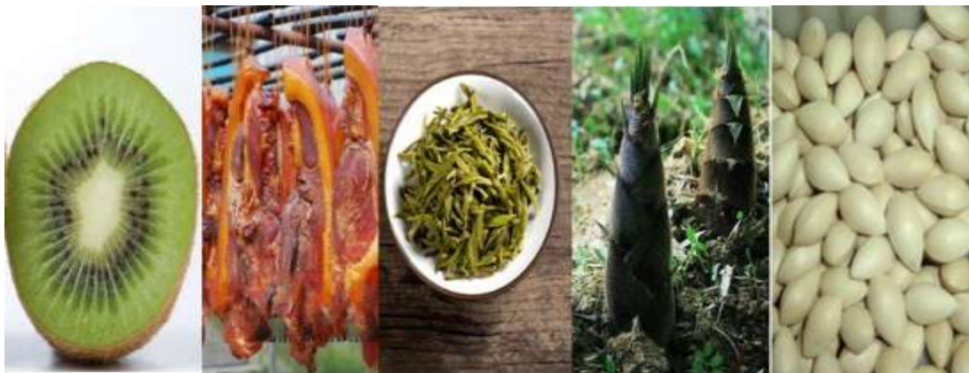
Figure 1. The Qingcheng mountain featured agricultural products

Qingcheng mountain is a famous scenic spot in China, Sichuan province, which has a long history and high humanistic value. There are many featured agricultural products, such as kiwi fruit, bacon, tea, bamboo shoots, Ligusticum wallichii , Magnolia officinalis , egg, Ginkgo biloba , etc. Fig.1 is the picture of the kiwi fruit, bacon, tea, bamboo shoots and the Ginkgo biloba . Most of the Qingcheng mountain featured agricultural products are food, some of it are traditional chinese medicine raw materials.