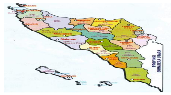
Fig. 1. Map of PM-PMP Service in Aceh Province.

To solve the problems then was conducted PM-PMP Service in 2012 at the same targeted schools.