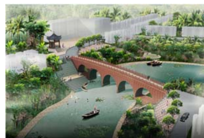
FIGURE IV. THE REAPPEAR DESIGN OF THE BUILDING LANDSCAPE AND ENVIRONMENT No.2