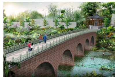
FIGURE III. THE REAPPEAR DESIGN OF THE BUILDING LANDSCAPE AND ENVIRONMENT

We are greatly grateful to the great amount of support from the Nanning Administration of Press and Television and the Government of Xinjiang County that we have received. The methods presented in this article are merely the viewpoints of the authors and are in need of further improvements. However, hopefully some lessons can be drawn from it for other researchers.