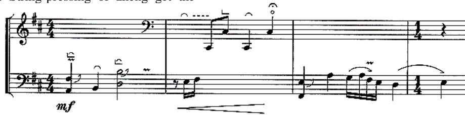
Fig. 8. Example of Left-handed technique "portamento".

Portamento is also used much in the song with different forms. For example in "Fig. 8":