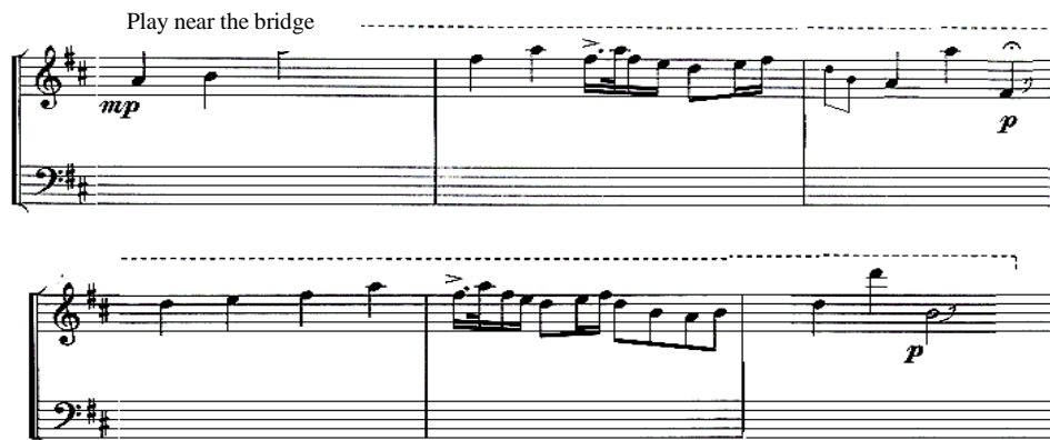
Fig. 5. Segment B, part b1.

by one octave. The composer notes here: "playing this segment near the bridge". In such way, the sound will be bright but not sharp, soft and elegant, which also highlight the quiet and noble bamboo character. As shown in "Fig. 5":