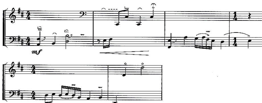
Fig. 1. Introduction section.

= 40, which paves the way for the color of the whole song in quiet and calm temperament and guide the entire song.