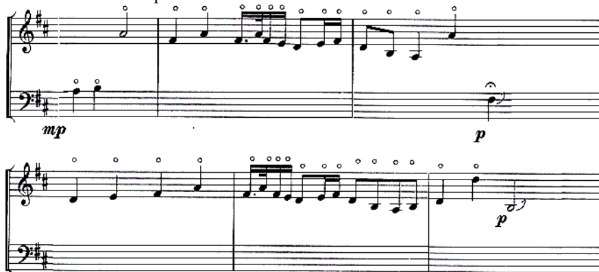
Fig. 3. Segment B, part b.

Part b contains six sections, elaborated with overtones, and the old material is used to further explore the music