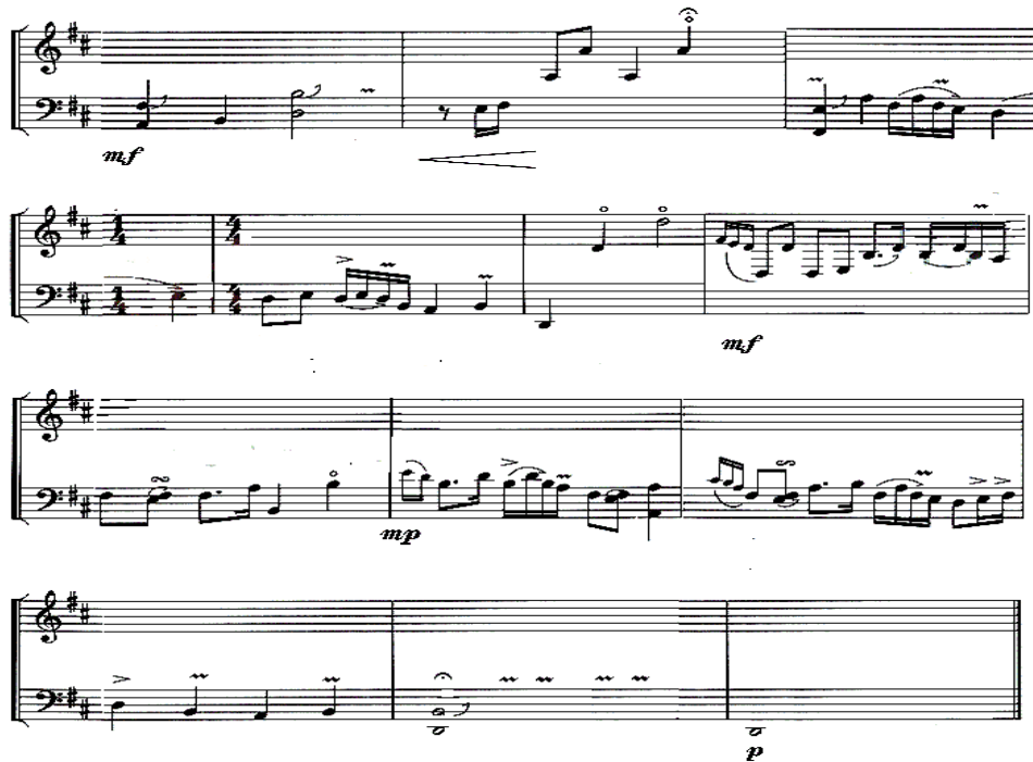
Fig. 6. Reappearance part.

In the "Bamboo Rhyme", such a phrase runs through the whole song in "Fig. 7":