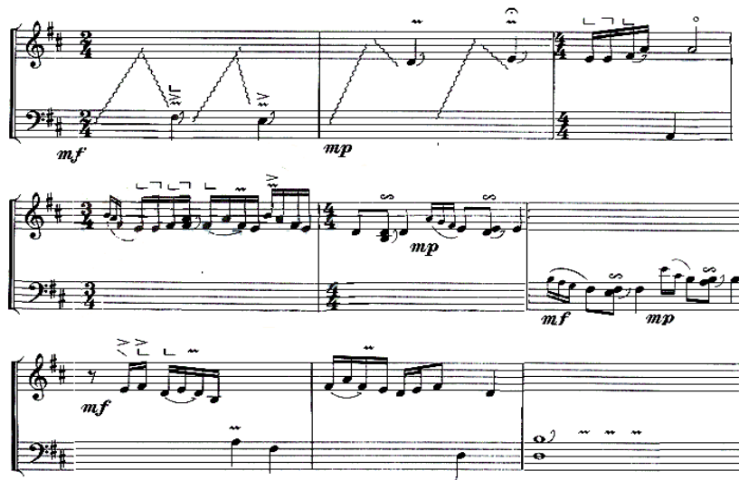
Fig. 4. Segment B, part c.

Part b1 still uses the old material of segment b and the notes, rhythms and the number of sections is the same as that of segment b. The overtone technique is discarded and replaced with flatness playing, so the entire segment is raised