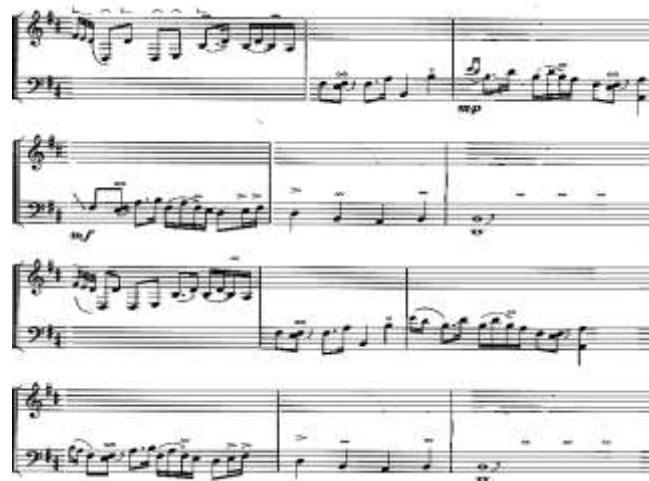
Fig. 2. Music theme of segment A.

sections, with a strong sense of balance. The two phrases are almost identical, and there is a repeated theme throughout the whole song. As "Fig. 2" shows: