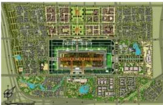
Fig. 3. The site plan of Epang Palace Archaeological Park.

Besides, given Archaeological Park's specificity, "big museum" concept is applied in Epang Palace Archaeological Park Project. Fully utilizing cultural resources and geographic environment resources, Epang Palace Archaeological Park is going to be constructed as an urban green heritage protection area with historical characteristics from Qin and Early Han Dynasty in 'Fig. 3' and 'Fig.4'. The heritage itself will echo outdoor and indoor exhibitions and blend with urban landscape. Special display will be applied to current urban landscape, forming cultural scene with historical authenticity. [7]