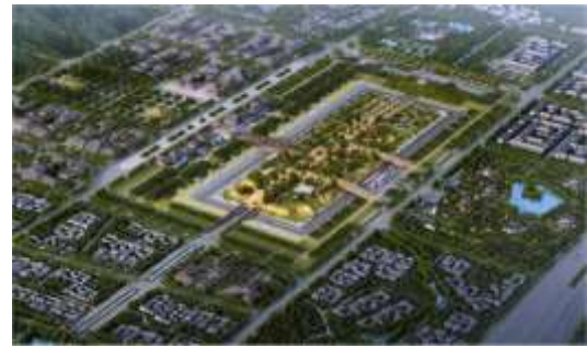
Fig. 4. The Design sketch of Epang Palace Archaeological Park