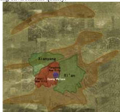
Fig. 1. The location map of Epang Palace.

planning theory of ancient capitals. In the Archaeological Park, there contains Epang Palace Front Court Heritage and other six architectural heritages from the Warring States Period to Qin Dynasty. The group of remains present a spatial characteristic of “one major with three minors”. Readable historical pattern, undamaged remains, continuous and logical spatial distribution in this area is the quintessence of ancient cities. Historical remains lay a good foundation for showing area change during the time and improving environment quality.