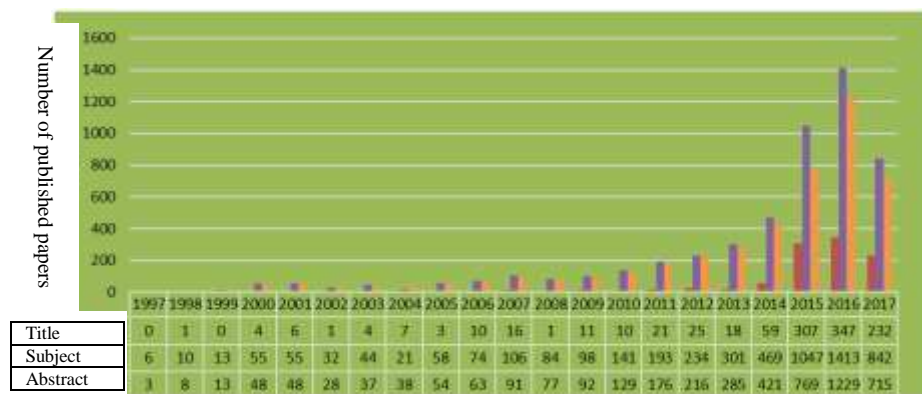
Fig. 1. Article search with search terms of "Internet" and "tourism"

Note: the data of 2017 up to October 31, 2017