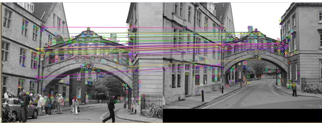
Figure 3. Feature Matching Experiments

After the threshold value and the basic matrix filter, the points are basically covered in the key area of the image, the distribution of pixel points is relatively uniform, and the error is low, which can meet the matching requirements of the system. The matching test image is shown in figure 3.