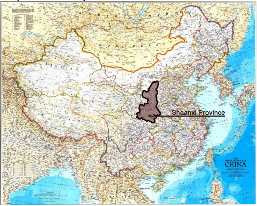
Fig.1. Shaanxi province of China

Shaanxi province is located in east longitude 105 \circ 29 '- 111 \circ 15 ', north latitude 31 \circ 42 '- 39 \circ 35 ', in northwestern of China, and its capital city is Xi'an. Shaanxi province covers 205,800 [square kilometers], and there is about 880 [km] from north to south while there is 160 \sim 490 [km] from east to west. Figure 1 shows place of Shaanxi province.